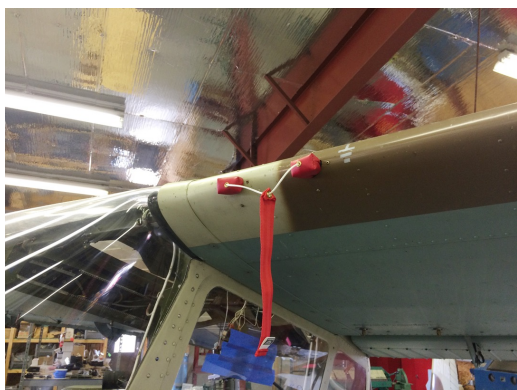
Siai Marchetti 1019 Ventilation Scoop Plugs