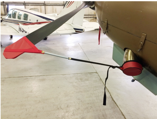
Siai Marchetti 1019 Prop Tie-Exhaust Covers