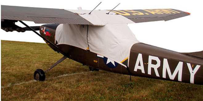
L-19 Canopy Cover (similar to Siai Marchetti 1019)