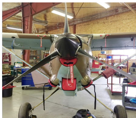
Siai Marchetti 1019 Engine Plugs, Prop Tie-Exhaust Covers