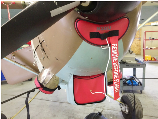
Siai Marchetti 1019 Engine Plugs, Prop Tie-Exhaust Covers

This cover type is made from Silver Acrylic Sunbrella canvas and is 100% lined with a soft and smooth microfiber. Bruce's Custom Covers developed this material combination especially for aircraft protection. The outer material is medium weight and treated for water resistance, UV resistance and anti-static buildup. The inner lining is a very soft and smooth microfiber to prevent scratching. The material is very reflective, and tests show that the cabin interior temperature can be reduced to near-ambient temperature on the hottest of days. It is water, ice and snow repellent, yet breathable to allow moisture to escape from between the cover and the aircraft surface.