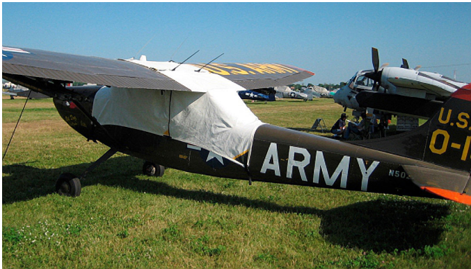
L-19 Canopy Cover (similar to Siai Marchetti 1019)

This cover type is made from Silver Acrylic Sunbrella canvas and is 100% lined with a soft and smooth microfiber. Bruce's Custom Covers developed this material combination especially for aircraft protection. The outer material is medium weight and treated for water resistance, UV resistance and anti-static buildup. The inner lining is a very soft and smooth microfiber to prevent scratching. The material is very reflective, and tests show that the cabin interior temperature can be reduced to near-ambient temperature on the hottest of days. It is water, ice and snow repellent, yet breathable to allow moisture to escape from between the cover and the aircraft surface.