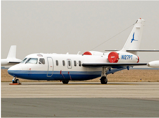
Engine Covers & Cockpit HeatShields

The Israel Aircraft Industries Jet Commander 1121 Bikini Style Engine Covers are a single-piece design using a soft and smooth stretchy and fabric. The cover stretches tightly over both the intake and exhaust, installing quickly and easily. These covers are designed to be used as hangar dust covers and have a useful life of approximately one year.