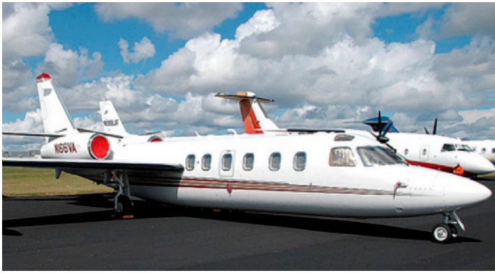
Westwind Engine Intake Plugs