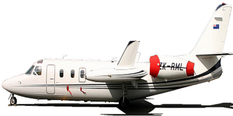
Jet Commander Engine Covers

The Israel Aircraft Westwind 1123 Bikini Style Engine Covers are a single-piece design using a soft and smooth stretchy fabric. The cover stretches tightly over both the intake and exhaust, installing quickly and easily. These covers are designed to be used as hangar dust covers and have a useful life of approximately one year.