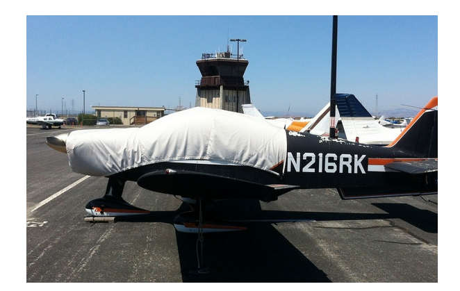
Robin R.2160 Canopy Cover