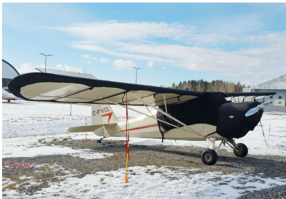
Aeronca Chief 11AC Canopy, Insulated Engine, & Wing Covers

This cover type is made from Silver Acrylic Sunbrella canvas and is 100% lined with a soft and smooth microfiber. Bruce's Custom Covers developed this material combination especially for aircraft protection. The outer material is medium weight and treated for water resistance, UV resistance and anti-static buildup. The inner lining is a very soft and smooth microfiber to prevent scratching. The material is very reflective, and tests show that the cabin interior temperature can be reduced to near-ambient temperature on the hottest of days. It is water, ice and snow repellent, yet breathable to allow moisture to escape from between the cover and the aircraft surface.