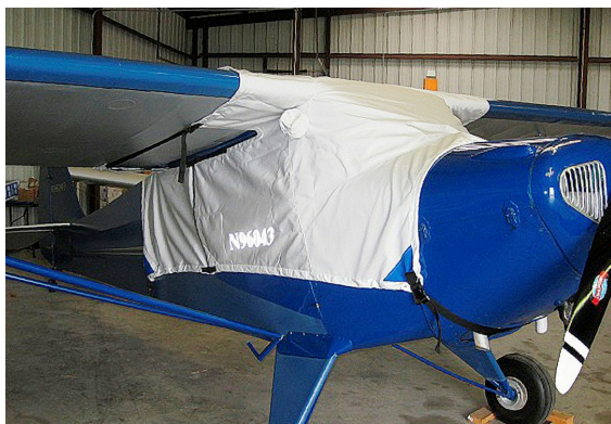
Taylorcraft BC12-D Over-the-top Canopy Cover

This cover type is made from Silver Acrylic Sunbrella canvas and is 100% lined with a soft and smooth microfiber. Bruce's Custom Covers developed this material combination especially for aircraft protection. The outer material is medium weight and treated for water resistance, UV resistance and anti-static buildup. The inner lining is a very soft and smooth microfiber to prevent scratching. The material is very reflective, and tests show that the cabin interior temperature can be reduced to near-ambient temperature on the hottest of days. It is water, ice and snow repellent, yet breathable to allow moisture to escape from between the cover and the aircraft surface.