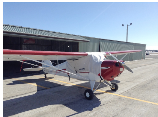
Aeronca Chief Canopy Cover