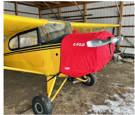
Aeronca 11AC Chief Insulated Engine Cover