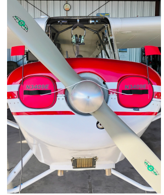
ENGINE PLUGS PREVENT BIRD NEST FOD. Piper Saratoga Engine Cowling Bird's Nest Aeronca 7AC Engine Inlet Plugs