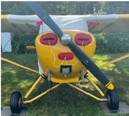
Aeronca 11CC Super Chief Engine Plugs, Extended Canopy Cover (also covers gas caps)

This cover type is made from Silver Acrylic Sunbrella canvas and is 100% lined with a soft and smooth microfiber. Bruce's Custom Covers developed this material combination especially for aircraft protection. The outer material is medium weight and treated for water resistance, UV resistance and anti-static buildup. The inner lining is a very soft and smooth microfiber to prevent scratching. The material is very reflective, and tests show that the cabin interior temperature can be reduced to near-ambient temperature on the hottest of days. It is water, ice and snow repellent, yet breathable to allow moisture to escape from between the cover and the aircraft surface.