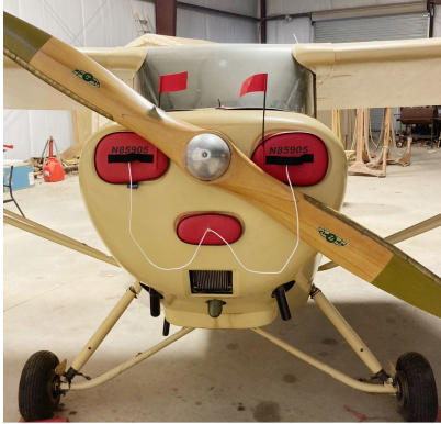
Aeronca 11AC Chief Engine Plugs

Engine Inlet Plugs are custom fit for your Aeronca Chief 11AC, Super Chief 11CC intakes, made with heavy-duty vinyl material, and stuffed with a single block of sculpted urethane foam. Each plug has a zipper that allows the foam to be removed and dried if necessary. Engine plugs have warning flags that are visible from the cockpit or 'remove before flight' streamers sewn onto the face of the plugs. Most plugs are imprinted with the aircraft registration number in black for an extra charge. Storage bag NOT included. Engine plugs may be inserted after flight when the engine is still warm. Engine Inlet Plugs are commonly referred to as Cowl Plugs, Intake Plugs, Cowl Blocks, Engine Blocks, and Engine Bungs.