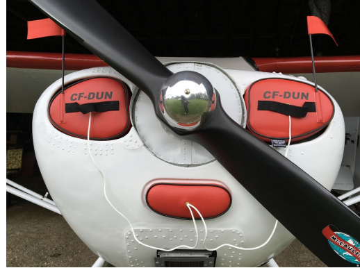
Aeronca 11AC Engine Inlet Plugs