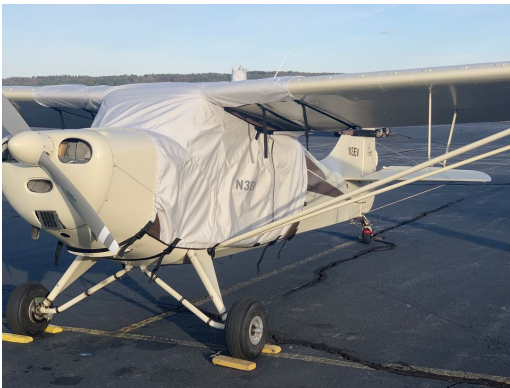
Aeronca Chief 11BC Extended Over-Top Canopy Cover

This cover type is made from Silver Acrylic Sunbrella canvas and is 100% lined with a soft and smooth microfiber. Bruce's Custom Covers developed this material combination especially for aircraft protection. The outer material is medium weight and treated for water resistance, UV resistance and anti-static buildup. The inner lining is a very soft and smooth microfiber to prevent scratching. The material is very reflective, and tests show that the cabin interior temperature can be reduced to near-ambient temperature on the hottest of days. It is water, ice and snow repellent, yet breathable to allow moisture to escape from between the cover and the aircraft surface.