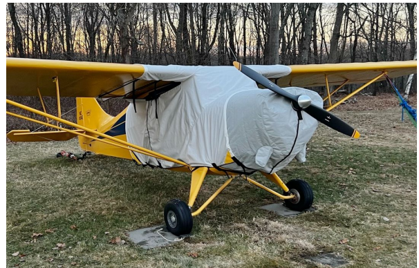
Aeronca Chief 11AC, Super Chief 11CC Insulated Engine Cover