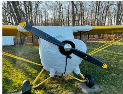
Aeronca Super Chief 11CC Extended Over-Top Canopy Cover, Insulated Engine Cover