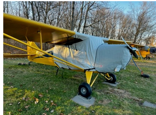
Aeronca Super Chief 11CC Extended Over-Top Canopy Cover, Insulated Engine Cover