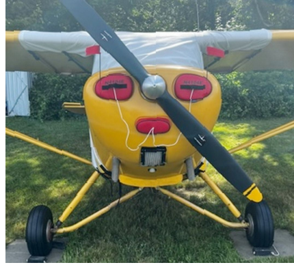
Aeronca 7AC Engine Inlet Plugs