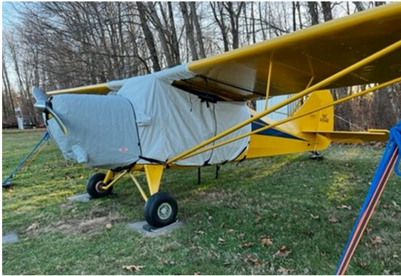
Aeronca Super Chief 11CC Extended Over-Top Canopy Cover, Insulated Engine Cover

This cover type is made from Silver Acrylic Sunbrella canvas and is 100% lined with a soft and smooth microfiber. Bruce's Custom Covers developed this material combination especially for aircraft protection. The outer material is medium weight and treated for water resistance, UV resistance and anti-static buildup. The inner lining is a very soft and smooth microfiber to prevent scratching. The material is very reflective, and tests show that the cabin interior temperature can be reduced to near-ambient temperature on the hottest of days. It is water, ice and snow repellent, yet breathable to allow moisture to escape from between the cover and the aircraft surface.