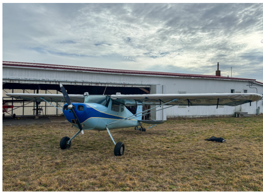
Cessna 140 Wing Covers, All Year Use, specify fabric wings (set of 2)