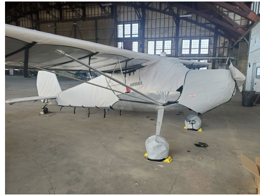
Cessna 140 Canopy, Wings, Prop, Tires & Empennage Covers