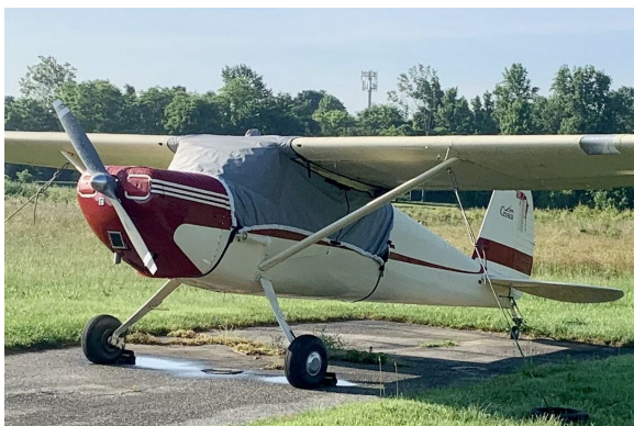
Cessna 140 Travel Weight Canopy Cover

This cover type is made from Silver Acrylic Sunbrella canvas and is 100% lined with a soft and smooth microfiber. Bruce's Custom Covers developed this material combination especially for aircraft protection. The outer material is medium weight and treated for water resistance, UV resistance and anti-static buildup. The inner lining is a very soft and smooth microfiber to prevent scratching. The material is very reflective, and tests show that the cabin interior temperature can be reduced to near-ambient temperature on the hottest of days. It is water, ice and snow repellent, yet breathable to allow moisture to escape from between the cover and the aircraft surface.