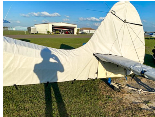
Aeronca Sedan Empennage Cover (Tailboom, Vertical & Horiz Stabilizers), All Year Use