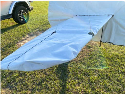
Aeronca Sedan Empennage Cover (Tailboom, Vertical & Horiz Stabilizers), All Year Use

WINTER USE MATERIAL - Made with Solution-Dyed Polyester fabric, this option is intended for seasonal use to aid in deicing, rain mitigation, or for occasional travel. The material is lighter and more compact, but more susceptible to UV damage and may have a shorter useful life if used continuously outside than the all-year use material.