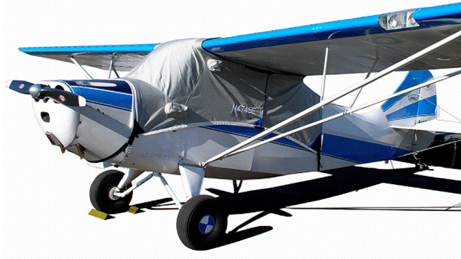
Aeronca Champ Canopy Cover