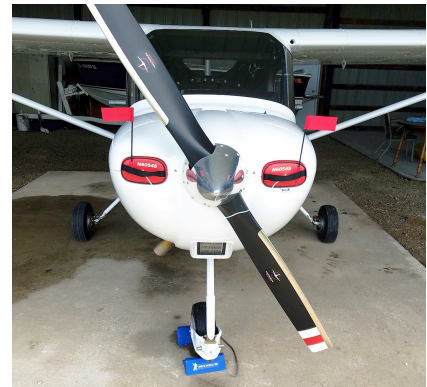
Cessna Skycatcher 162 Engine Inlet Plugs