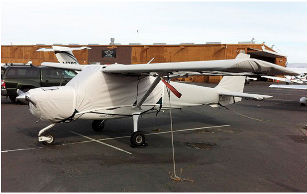
Cessna Skycatcher Full Cover Set