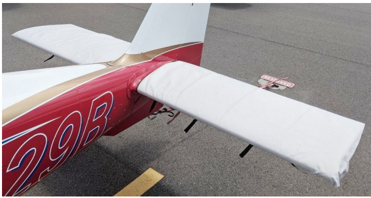
Cessna 162 Skycatcher Horizontal Stabilizer Covers