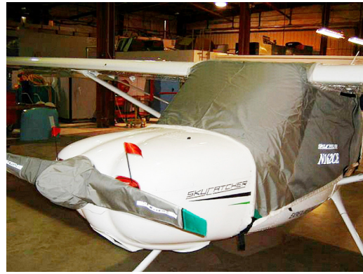
Cessna Skycatcher Standard Canopy Cover, Propellor Cover & Engine Inlet Plugs