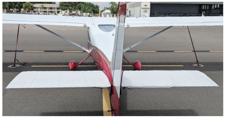
Cessna 162 Skycatcher Horizontal Stabilizer Covers