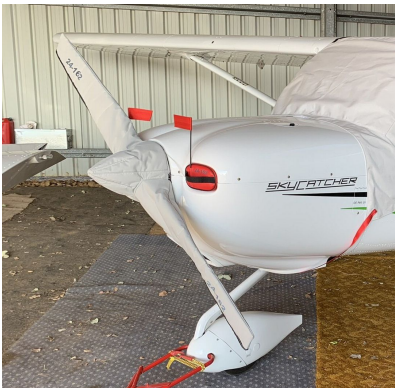
Cessna Skycatcher 162 Canopy Cover and Engine Inlet Plugs Cessna Skycatcher Prop/Spinner Cover, Engine Plugs