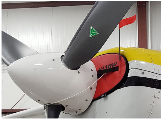
Cessna 180/185 Skywagon Engine Inlet Plugs