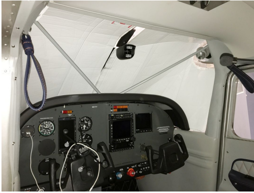
Cessna 180 Skywagon Windshield Heatshield, (W/ Compass)

Windshield Heatshields are interior sunshades for an aircraft's front windshield. The product is a unique composite of closed-cell foam with a silver mylar finish. The semi-rigid design is stiff enough to stand along the inside of the windshield using sun visors or window framing. It folds up flat and easily stores in the included storage sleeve. Some designs may require velcro and suction cups or split right and left sides. A Heatshield is an excellent short-term remedy for cockpit overheating. An external fabric cover is far more effective and practical for long-term protection.