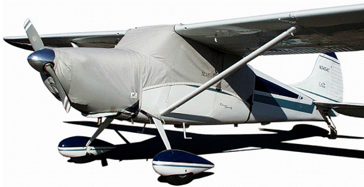
Cessna 170 Canopy Cover & Engine Cover

This cover type is made from Silver Acrylic Sunbrella canvas and is 100% lined with a soft and smooth microfiber. Bruce's Custom Covers developed this material combination especially for aircraft protection. The outer material is medium weight and treated for water resistance, UV resistance and anti-static buildup. The inner lining is a very soft and smooth microfiber to prevent scratching. The material is very reflective, and tests show that the cabin interior temperature can be reduced to near-ambient temperature on the hottest of days. It is water, ice and snow repellent, yet breathable to allow moisture to escape from between the cover and the aircraft surface.