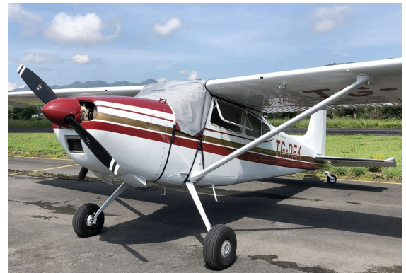
Cessna 180 Windshield Cover