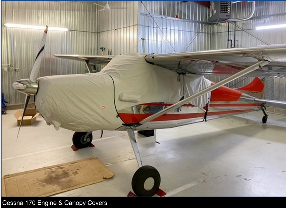
Cessna 170 Engine &amp; Canopy Covers