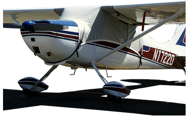
Over-the-Top Canopy Cover