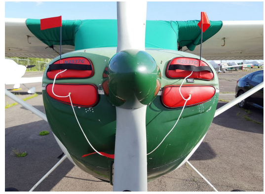
1954 Cessna 170B Engine Inlet Plugs