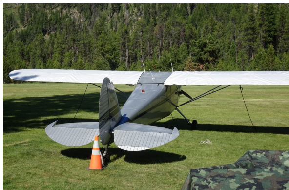
Cessna 170 Wing Covers

WINTER USE MATERIAL - Made with Solution-Dyed Polyester fabric, this option is intended for seasonal use to aid in deicing, rain mitigation, or for occasional travel. The material is lighter and more compact, but more susceptible to UV damage and may have a shorter useful life if used continuously outside than the all-year use material.