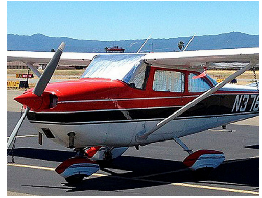
Cessna 172 Cabin HeatShields