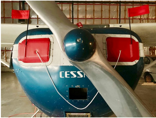
Cessna 170B Engine Inlet Blocking Card

This cover type is made from Silver Acrylic Sunbrella canvas and is 100% lined with a soft and smooth microfiber. Bruce's Custom Covers developed this material combination especially for aircraft protection. The outer material is medium weight and treated for water resistance, UV resistance and anti-static buildup. The inner lining is a very soft and smooth microfiber to prevent scratching. The material is very reflective, and tests show that the cabin interior temperature can be reduced to near-ambient temperature on the hottest of days. It is water, ice and snow repellent, yet breathable to allow moisture to escape from between the cover and the aircraft surface.