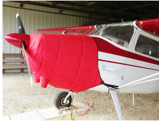
Cessna 170 Insulated Engine Cover, Tailored around the Venturi Tube by design.