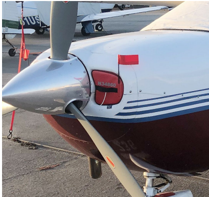
Cessna Cardinal Engine Plugs

Engine Inlet Plugs are custom fit for your Cessna 177 Cardinal intakes, made with heavy-duty vinyl material, and stuffed with a single block of sculpted urethane foam. Each plug has a zipper that allows the foam to be removed and dried if necessary. Engine plugs have warning flags that are visible from the cockpit or 'remove before flight' streamers sewn onto the face of the plugs. Most plugs are imprinted with the aircraft registration number in black for an extra charge. Storage bag NOT included. Engine plugs may be inserted after flight when the engine is still warm. Engine Inlet Plugs are commonly referred to as Cowl Plugs, Intake Plugs, Cowl Blocks, Engine Blocks, and Engine Bungs.