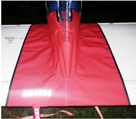
Cessna 177 Cardinal Tailcone Cover (Fully Enclosed)

WINTER USE MATERIAL - Made with Solution-Dyed Polyester fabric, this option is intended for seasonal use to aid in deicing, rain mitigation, or for occasional travel. The material is lighter and more compact, but more susceptible to UV damage and may have a shorter useful life if used continuously outside than the all-year use material.