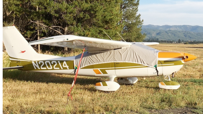
Cessna 177 Cardinal Travel Cover, Light Weight Travel Canopy Cover (Wrap Around), 6 Lbs