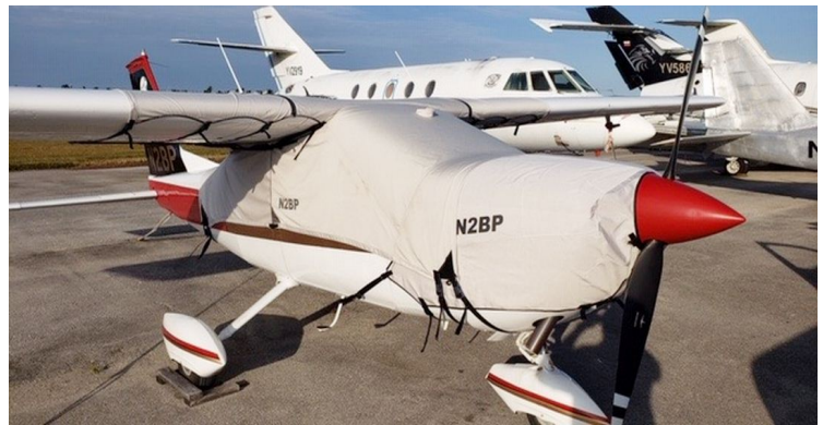
Cessna Cardinal 177 Engine Cover & Over-Top Canopy Cover with Wing Extensions