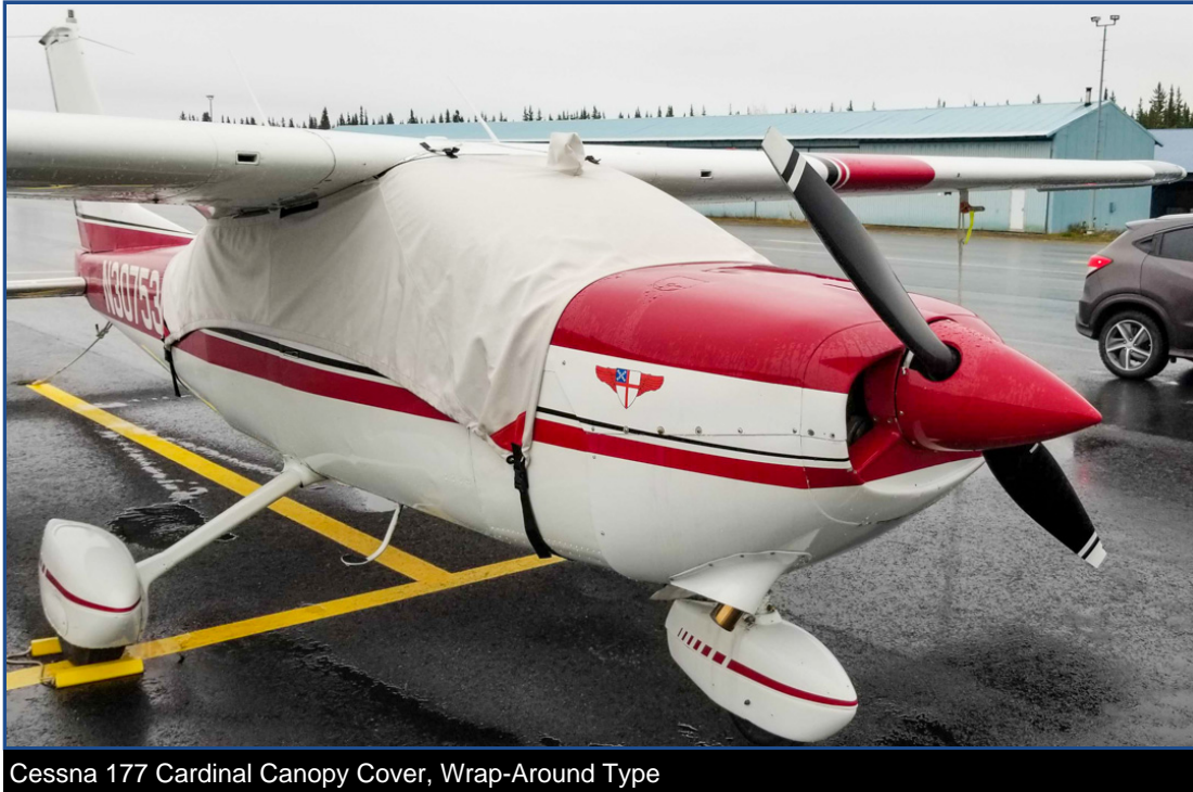
Cessna 177 Cardinal Canopy Cover, Wrap-Around Type