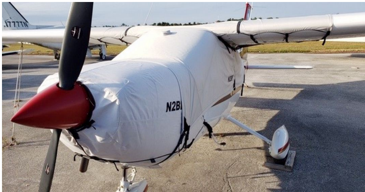
Cessna Cardinal 177 Engine Cover & Over-Top Canopy Cover with Wing Extensions

This cover type is made from Silver Acrylic Sunbrella canvas and is 100% lined with a soft and smooth microfiber. Bruce's Custom Covers developed this material combination especially for aircraft protection. The outer material is medium weight and treated for water resistance, UV resistance and anti-static buildup. The inner lining is a very soft and smooth microfiber to prevent scratching. The material is very reflective, and tests show that the cabin interior temperature can be reduced to near-ambient temperature on the hottest of days. It is water, ice and snow repellent, yet breathable to allow moisture to escape from between the cover and the aircraft surface.