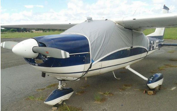
Cessna 177 Cardinal Travel Canopy Cover

Travel Covers are made with Silver Solution-Dyed Polyester fabric and only lined over the windshield to save weight. The material is lightweight and more compact for easy stowage in the aircraft. The polyester material is water resistant, but only intended for occasional use outside. We also have an ultra lightweight material available for fitted hangar dust covers. For daily outdoor use, the non-travel Sunbrella Cover is the best choice.