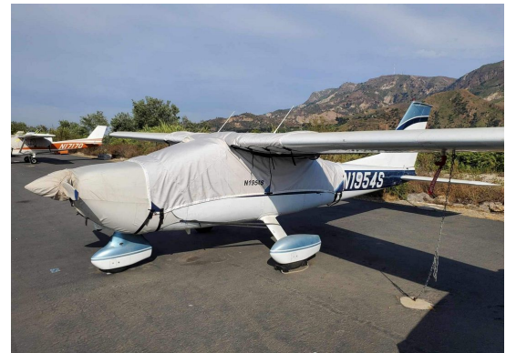
Cessna 177 Cardinal Canopy Cover, Over-Top Style, Belly Strap Type, Extends Out Past Gas Caps, Extends 6" In Front, 8" In Back