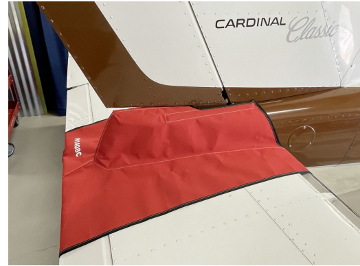
Cessna 177 Cardinal Tailcone Cover, Fully Enclosed