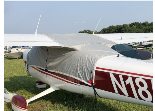
Cessna 177 Cardinal Travel Cover, Light Weight Travel Canopy Cover (Over-The-Top Style), 7 Lbs