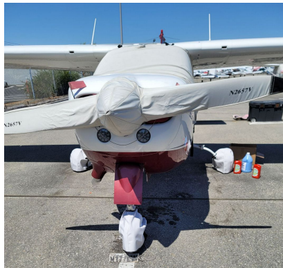
Cessna 177RG Tire & Prop Covers

ALL-YEAR USE MATERIAL - Made with Silver Acrylic Sunbrella canvas, the all-year use material is the best option for sun protection and cover longevity. This heavier more durable material is intended for all weather conditions, such as rain and snow or lots of sun.