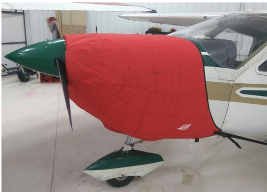
Cessna 177 Cardinal Insulated Engine Cover, Powerflow Exhaust

This cover type is made from Silver Acrylic Sunbrella canvas and is 100% lined with a soft and smooth microfiber. Bruce's Custom Covers developed this material combination especially for aircraft protection. The outer material is medium weight and treated for water resistance, UV resistance and anti-static buildup. The inner lining is a very soft and smooth microfiber to prevent scratching. The material is very reflective, and tests show that the cabin interior temperature can be reduced to near-ambient temperature on the hottest of days. It is water, ice and snow repellent, yet breathable to allow moisture to escape from between the cover and the aircraft surface.