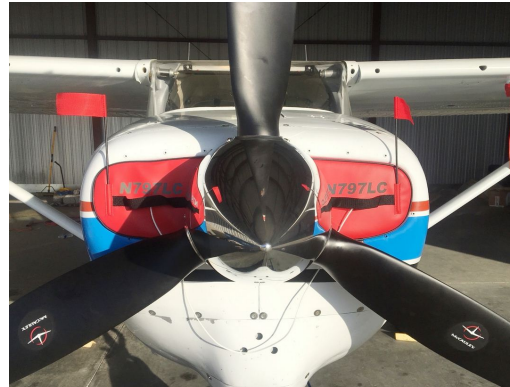
Cessna 210 Inlet Plugs, early model