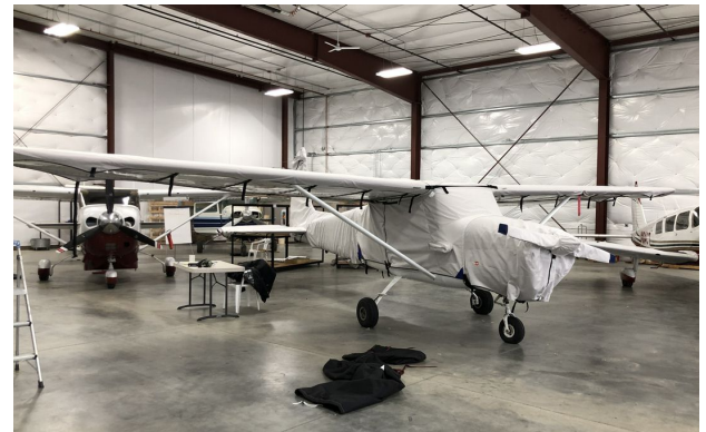
Cessna Cardinal Insulated Engine Cover (incl. Powerflow Exhaust)