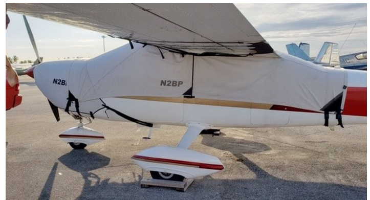
Cessna 177 Cardinal Over-Top Canopy Cover, extends to cover gas caps, & Wing Covers