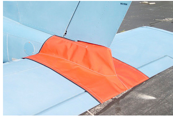
Cessna 177 Cardinal Tailcone Cover