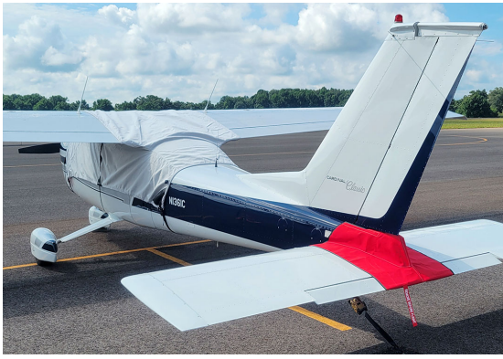
Cessna 177B Tailcone cover, fully enclosed