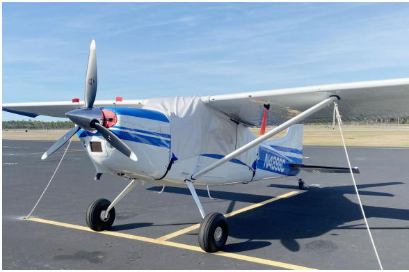
Cessna A185F Over-Top Canopy Cover, Engine Plugs.