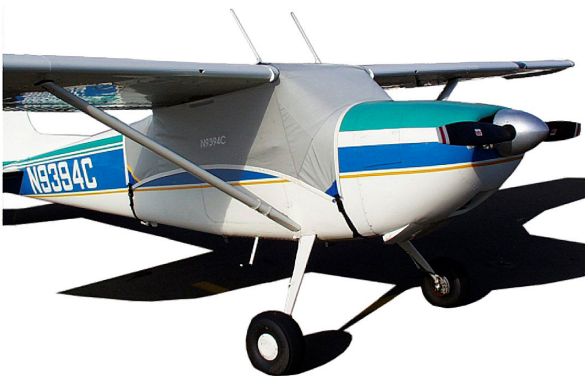
Cessna 180 Canopy Cover

This cover type is made from Silver Acrylic Sunbrella canvas and is 100% lined with a soft and smooth microfiber. Bruce's Custom Covers developed this material combination especially for aircraft protection. The outer material is medium weight and treated for water resistance, UV resistance and anti-static buildup. The inner lining is a very soft and smooth microfiber to prevent scratching. The material is very reflective, white and tests show that the cabin interior temperature can be reduced to near-ambient temperature on the hottest of days. It is water, ice and snow repellent, yet breathable to allow moisture to escape from between the cover and the aircraft surface.