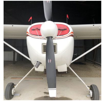
Cessna 180, 185 Engine Plugs