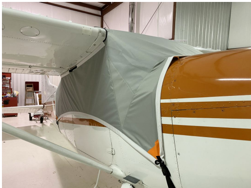
Cessna 180 Travel Weight Canopy Cover

The material is very reflective, and tests show that the cabin interior temperature can be reduced to near-ambient temperature on the hottest of days. It is water, ice and snow repellent, yet breathable to allow moisture to escape from between the cover and the aircraft surface.