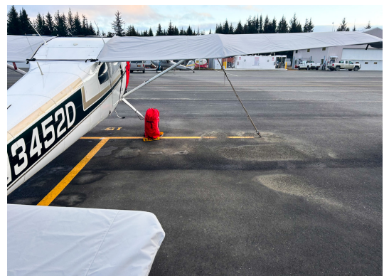
Cessna 180/185 Skywagon Windshield Cover