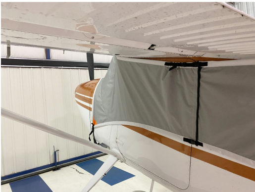
Cessna 180 Travel Weight Canopy Cover