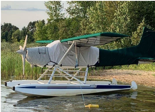
Cessna A185F Complete Cover Set

WINTER USE MATERIAL - Made with Solution-Dyed Polyester fabric, this option is intended for seasonal use to aid in deicing, rain mitigation, or for occasional travel. The material is lighter and more compact, but more susceptible to UV damage and may have a shorter useful life if used continuously outside than the all-year use material.