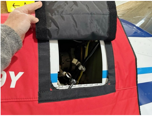
Cessna 180H Insulated Engine Cover