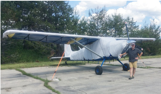
Cessna 180 Complete Hail Protection Cover Set