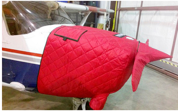
Cessna 172 Insulated Engine Cover w/ Oil Filler Door flap and Insulated Prop/Spinner Cover