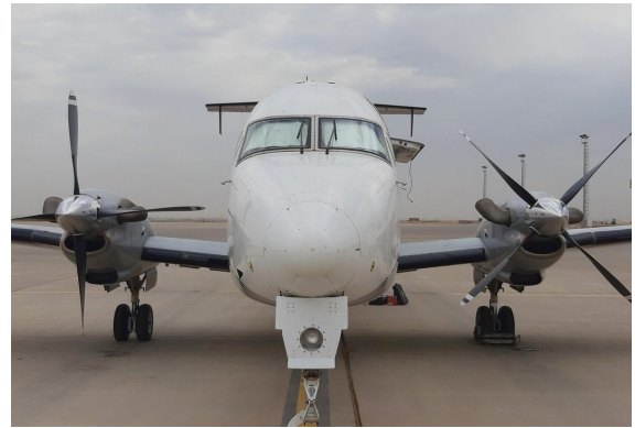
Raytheon 1900D Cockpit HeatShields