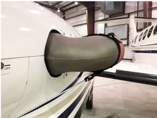
Beech King Air 350 Exhaust Covers

This cover type is made from Silver Acrylic Sunbrella canvas and is 100% lined with a soft and smooth microfiber. Bruce's Custom Covers developed this material combination especially for aircraft protection. The outer material is medium weight and treated for water resistance, UV resistance and anti-static buildup. The inner lining is a very soft and smooth microfiber to prevent scratching. The material is very reflective, and tests show that the cabin interior temperature can be reduced to near-ambient temperature on the hottest of days. It is water, ice and snow repellent, yet breathable to allow moisture to escape from between the cover and the aircraft surface.