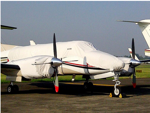
King Air 350 Canopy/Nose Cover, Engine Covers

The Beech 1900D Nose Cover is designed to cover the section of the fuselage forward of the windshield to the tip of the nose. It is secured with belly strapsThis cover type is made from Silver Acrylic Sunbrella canvas and is 100% lined with a soft and smooth microfiber. Bruce's Custom Covers developed this material combination especially for aircraft protection. The outer material is medium weight and treated for water resistance, UV resistance and anti-static buildup. The inner lining is a very soft and smooth microfiber to prevent scratching. The material is very reflective, and tests show that the cabin interior temperature can be reduced to near-ambient temperature on the hottest of days. It is water, ice and snow repellent, yet breathable to allow moisture to escape from between the cover and the aircraft surface.