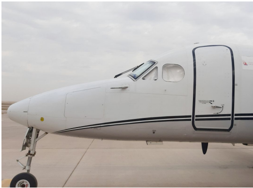
Raytheon 1900D Cockpit HeatShields

Cockpit Heatshields are interior sunshades for the aircraft's cockpit. The product is a unique composite of closed-cell foam with a silver mylar finish. The semi-rigid design is stiff enough to stand inside the window framing. The set folds up flat and is easily stored in the included storage sleeve. Some designs may require velcro and suction cups. A Heatshield is an excellent short-term remedy for cockpit overheating, but an external fabric cover is more effective for long-term protection.