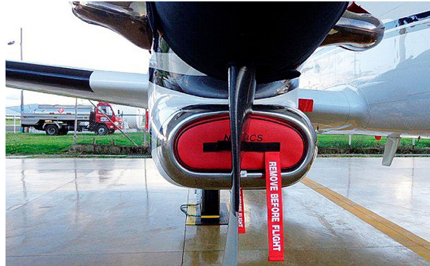
Beech King Air C90B Main Engine Inlet Plug