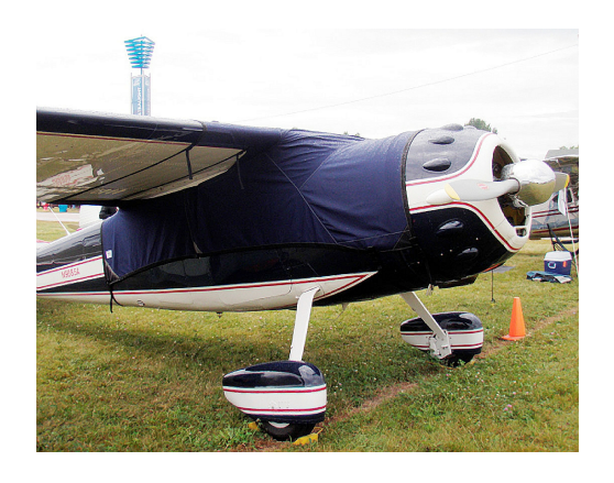
Cessna 195 CANOPY COVER, over-top, 24" fwd ext to cover cowl ring Cessna 195 Canopy Cover, extended forward and over gap, gas cap ext. gas caps