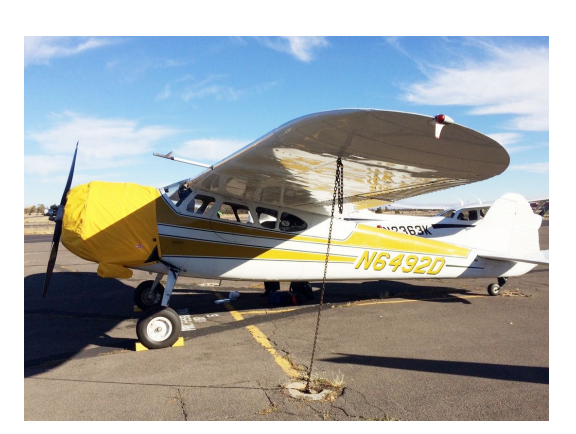
Cessna 195 Engine Cover