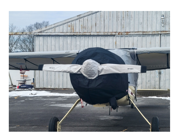
Cessna 190 Travel Canopy, Insulated Engine, Wing & Prop Covers