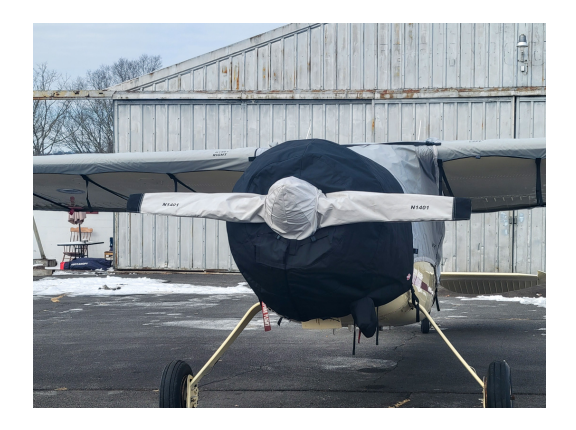
Cessna 195 Over-Top Canopy, Engine & Prop Covers