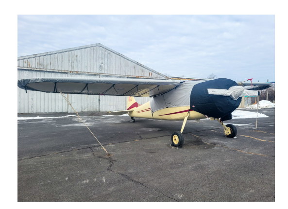
Cessna 190 Travel Canopy, Insulated Engine, Wing & Prop Covers

WINTER USE MATERIAL - Made with Solution-Dyed Polyester fabric, this option is intended for seasonal use to aid in deicing, rain mitigation, or for occasional travel. The material is lighter and more compact, but more susceptible to UV damage and may have a shorter useful life if used continuously outside than the all-year use material.