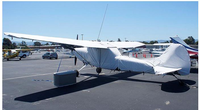
Wing Covers on Cessna Bird Dog