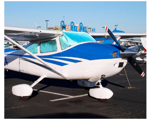
Cessna 182 HeatShield Set