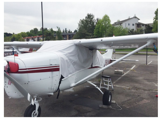
Cessna 205 Over-Top Canopy Cover