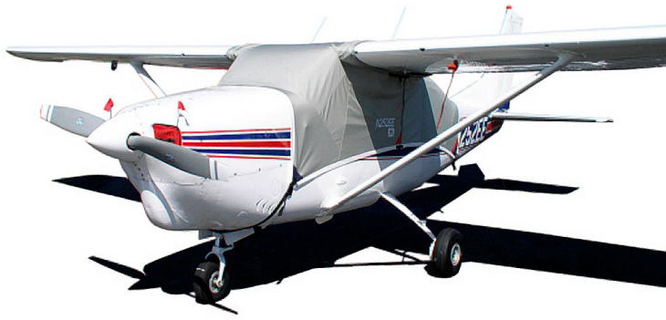
Cessna 210 Over-Top Canopy Cover