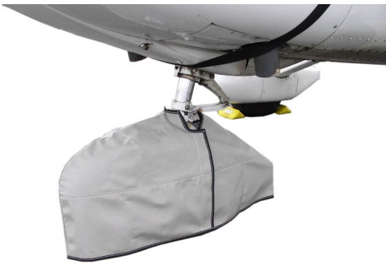
Cessna 172 Nose Gear Fairing Cover