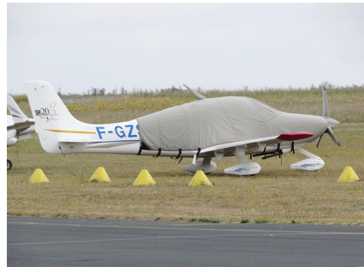
Cirrus SR-22 Extended Canopy/Engine Cover, Prop Cover, Wingtip Pads