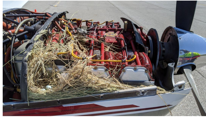
Cessna 206 Engine Inlet & Oil Cooler Plugs ENGINE PLUGS PREVENT BIRD NEST FOD. Piper Saratoga Engine Cowling Bird's Nest