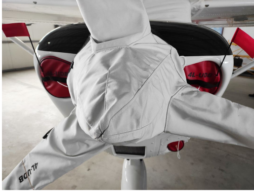
Cessna 206 3-Blade Prop Cover, Engine Plugs

This cover type is made from Silver Acrylic Sunbrella canvas and is 100% lined with a soft and smooth microfiber. Bruce's Custom Covers developed this material combination especially for aircraft protection. The outer material is medium weight and treated for water resistance, UV resistance and anti-static buildup. The inner lining is a very soft and smooth microfiber to prevent scratching. The material is very reflective, and tests show that the cabin interior temperature can be reduced to near-ambient temperature on the hottest of days. It is water, ice and snow repellent, yet breathable to allow moisture to escape from between the cover and the aircraft surface.