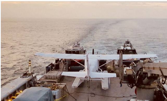
Cessna U206F Amphib Cover Set

WINTER USE MATERIAL - Made with Solution-Dyed Polyester fabric, this option is intended for seasonal use to aid in deicing, rain mitigation, or for occasional travel. The material is lighter and more compact, but more susceptible to UV damage and may have a shorter useful life if used continuously outside than the all-year use material.