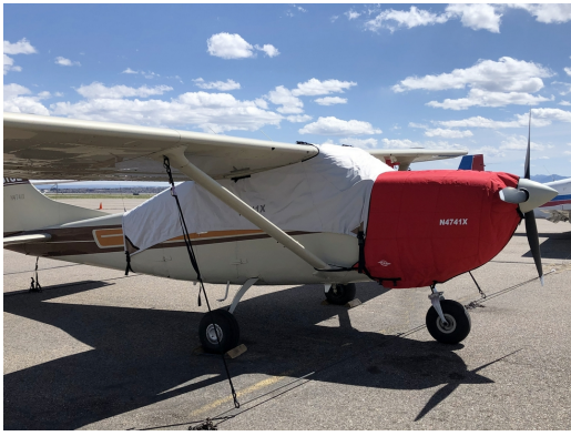
Cessna 206 Insulated Engine Cover, Canopy Cover