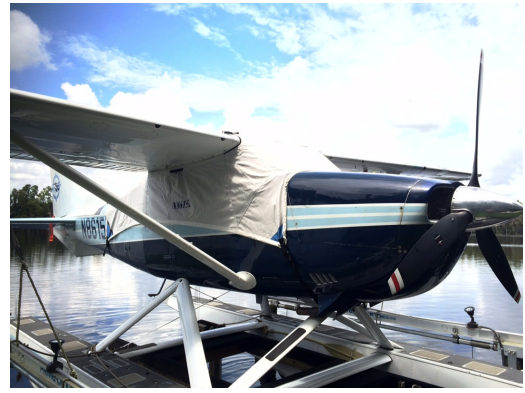
Cessna 206 Wrap-Around Canopy Cover