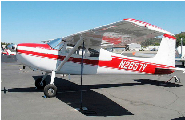
Cessna 180 & 185 Windshield HeatShield

Windshield Heatshields are interior sunshades for an aircraft's front windshield. The product is a unique composite of closed-cell foam with a silver mylar finish. The semi-rigid design is stiff enough to stand along the inside of the windshield using sun visors or window framing. It folds up flat and easily stores in the included storage sleeve. Some designs may require velcro and suction cups or split right and left sides. A Heatshield is an excellent short-term remedy for cockpit overheating. An external fabric cover is far more effective and practical for long-term protection.