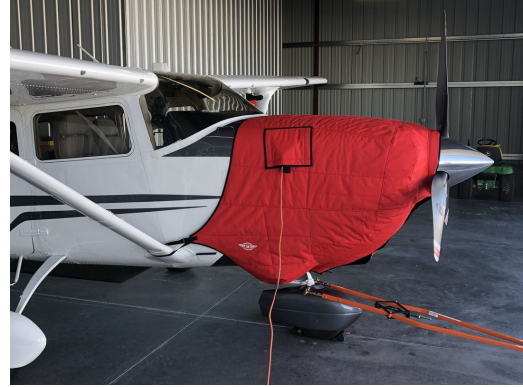
Cessna 206 Stationair Insulated Engine Cover