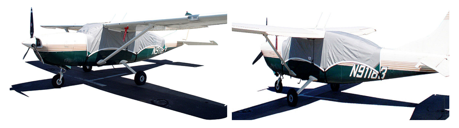
Cessna 207 Canopy Cover