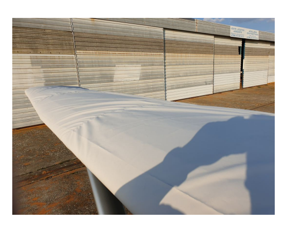
Cessna 207 Wing Covers