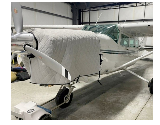
Cessna 172 Insulated Engine Cover w/ Oil Filler Door flap and Insulated Prop/Spinner Cover