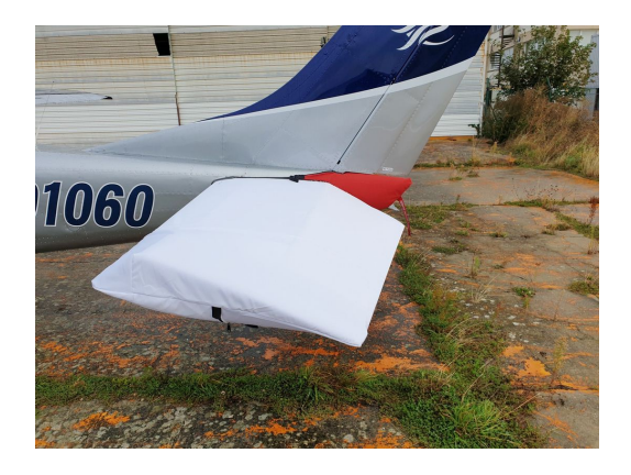
Cessna 207 Tailcone Cover, Horizontal Stab. Cover (test fit)

WINTER USE MATERIAL - Made with Solution-Dyed Polyester fabric, this option is intended for seasonal use to aid in deicing, rain mitigation, or for occasional travel. The material is lighter and more compact, but more susceptible to UV damage and may have a shorter useful life if used continuously outside than the all-year use material.