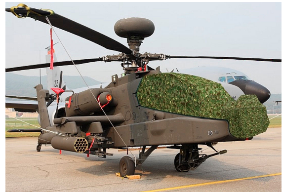
Canopy/Nose Cover, covers canopy glass and TADS