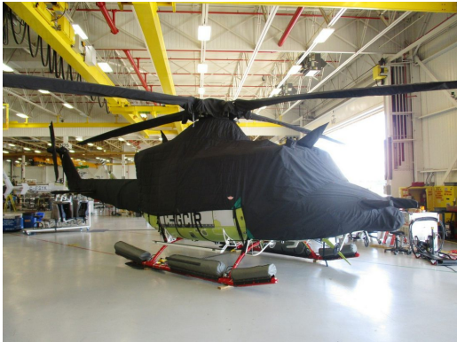
Bell 412 Cockpit/Canopy/Nose, Insulated Engine Area, Rotor Hub, Blade, Tailboom and Tail Rotor Covers