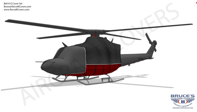
Bell 412 Forward Cabin/Nose, Insulated Engine, Tailboom, Rotor Hub & Blade Covers