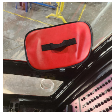
Boeing Vertol CH-47 Logger Window Plug