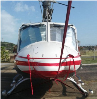
Bell 212 Windshield HeatShields

Cockpit Heatshields are interior sunshades for the aircraft's cockpit. The product is a unique composite of closed-cell foam with a silver mylar finish. The semi-rigid design is stiff enough to stand inside the window framing. Darts and folds are incorporated into the material so that it conforms to the complex shape of the helicopter windows. The set folds up flat and is easily stored in the included storage sleeve. Some designs may require velcro and suction cups. A Heatshield is an excellent short-term remedy for cockpit overheating, but an external fabric cover is more effective for long-term protection.