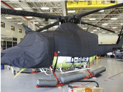
Bell 412 Cockpit/Canopy/Nose, Insulated Engine Area, Rotor Hub, Blade, Tailboom and Tail Rotor Covers

WINTER USE MATERIAL - Made with Solution-Dyed Polyester fabric, this option is intended for seasonal use to aid in deicing, rain mitigation, or for occasional travel. The material is lighter and more compact, but more susceptible to UV damage and may have a shorter useful life if used continuously outside than the all-year use material.