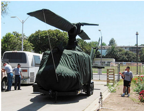
Bell 204/205 Full Body Cover Set

This cover type is made from Silver Acrylic Sunbrella canvas and is 100% lined with a soft and smooth microfiber. Bruce's Custom Covers developed this material combination especially for aircraft protection. The outer material is medium weight and treated for water resistance, UV resistance and anti-static buildup. The inner lining is a very soft and smooth microfiber to prevent scratching. The material is very reflective, and tests show that the cabin interior temperature can be reduced to near-ambient temperature on the hottest of days. It is water, ice and snow repellent, yet breathable to allow moisture to escape from between the cover and the aircraft surface.