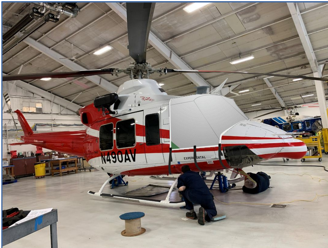
Bell 412 Cockpit/Canopy Cover, photo/illustration