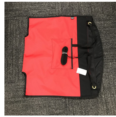
Bell 230 Blade Tie-Downs, (Semi-Rigid) W/Telescoping Attachment Handle