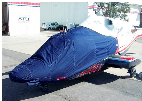
Bell 222 Bubble Cover