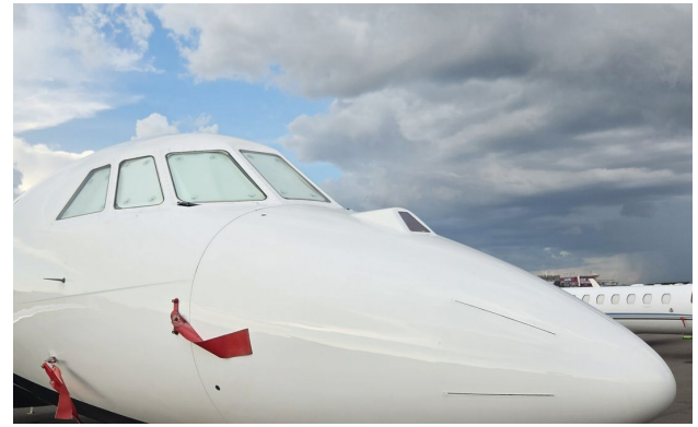
Dassault Aviation FALCON 2000EX Cockpit Heatshields (set of 7) Dassault Aviation FALCON 2000EX Cockpit Heatshields (set of 7)