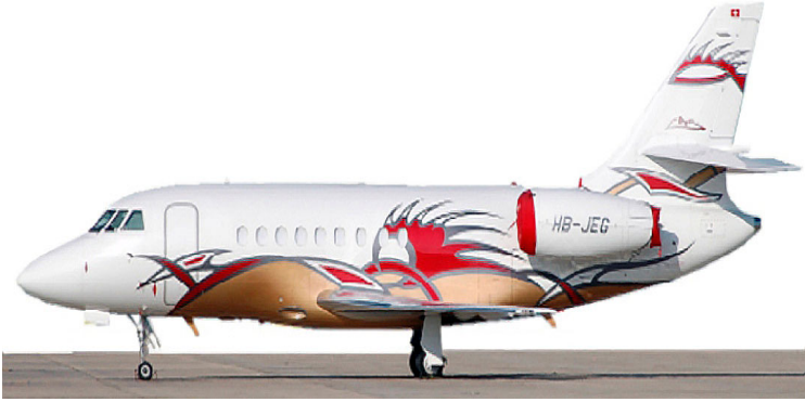
Falcon 2000EX Engine Cover Set, OEM Design