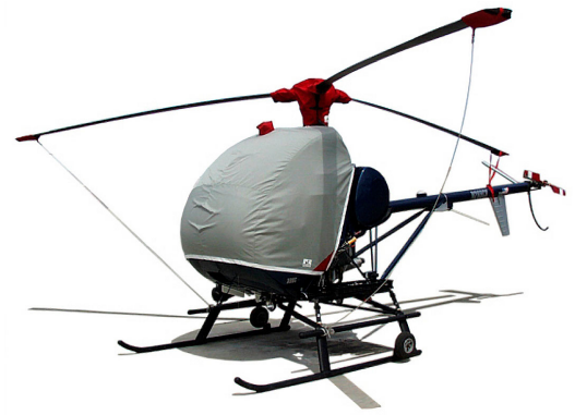
Bubble, Main Rotor & Blade Tie-Downs