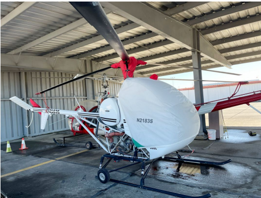
Schweizer 300C Bubble, Main & Tail Rotor Covers

WINTER USE MATERIAL - Made with Solution-Dyed Polyester fabric, this option is intended for seasonal use to aid in deicing, rain mitigation, or for occasional travel. The material is lighter and more compact, but more susceptible to UV damage and may have a shorter useful life if used continuously outside than the all-year use material.