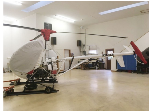
Schweizer 269C Rotor Hub cover