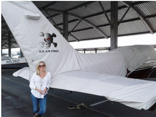
Cessna 310R Empennage Cover

shorter useful life if used continuously outside than the all-year use material.