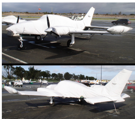
Cessna 310 Complete Cover Set