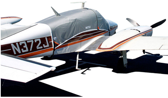
Cessna 320 Canopy Cover