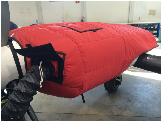
Cessna 402 Insulated Engine Cover with Heater