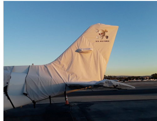
Cessna 421 Empennage Cover