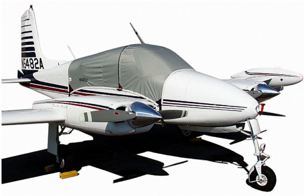
Cessna 310A Canopy Cover