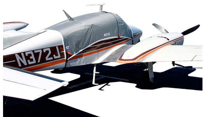
Cessna 320 Canopy Cover