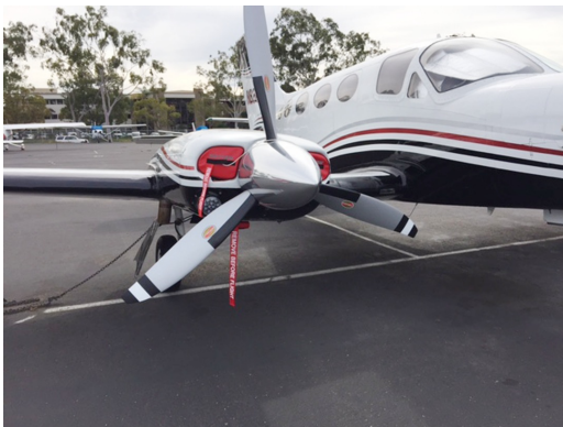
Cessna 414 Engine Inlet Plugs

Engine Inlet Plugs are custom fit for your Cessna 320 intakes, made with heavy-duty vinyl material, and stuffed with a single block of sculpted urethane foam. Each plug has a zipper that allows the foam to be removed and dried if necessary. Engine plugs have warning flags that are visible from the cockpit or 'remove before flight' streamers sewn onto the face of the plugs. Most plugs are imprinted with the aircraft registration number in black for an extra charge. Storage bag NOT included. Engine plugs may be inserted after flight when the engine is still warm. Engine Inlet Plugs are commonly referred to as Cowl Plugs, Intake Plugs, Cowl Blocks, Engine Blocks, and Engine Bungs.