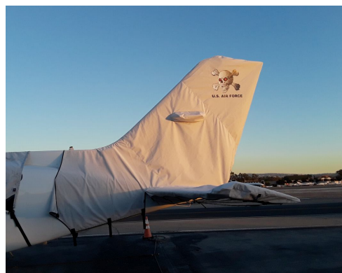
Cessna 421 Empennage Cover