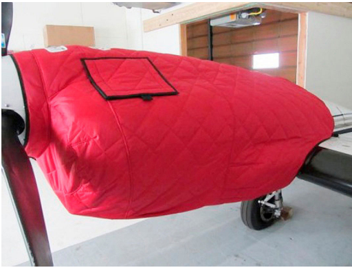
Cessna 421 Insulated Engine Covers