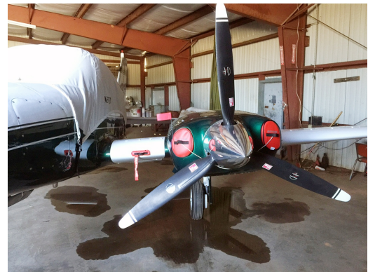
Cessna 310 Engine and Center Section Plugs