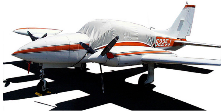
Cessna 310Q Canopy Cover