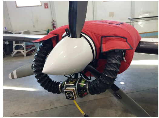
Cessna 402 Insulated Engine Cover with Heater