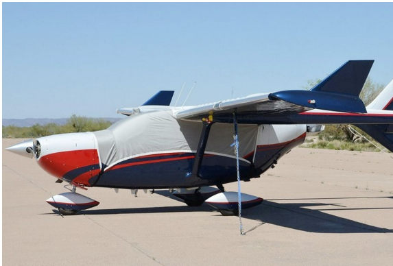
Canopy Cover with Forward Extension

This cover type is made from Silver Acrylic Sunbrella canvas and is 100% lined with a soft and smooth microfiber. Bruce's Custom Covers developed this material combination especially for aircraft protection. The outer material is medium weight and treated for water resistance, UV resistance and anti-static buildup. The inner lining is a very soft and smooth microfiber to prevent scratching. The material is very reflective, and tests show that the cabin interior temperature can be reduced to near-ambient temperature on the hottest of days. It is water, ice and snow repellent, yet breathable to allow moisture to escape from between the cover and the aircraft surface.