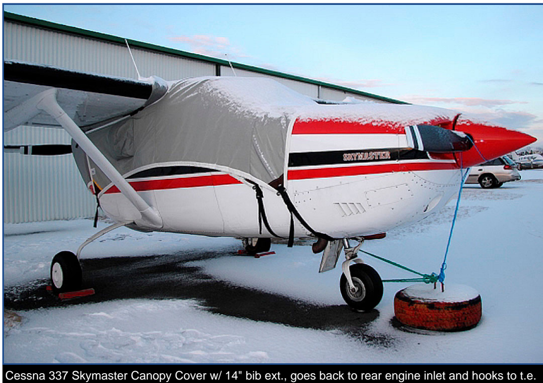
Cessna 337 Skymaster Canopy Cover w/ 14" bib ext., goes back to rear engine inlet and hooks to t.e.