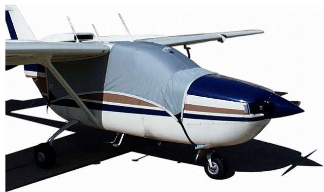
Cessna Skymaster Canopy Cover with Forward Extension

This cover type is made from Silver Acrylic Sunbrella canvas and is 100% lined with a soft and smooth microfiber. Bruce's Custom Covers developed this material combination especially for aircraft protection. The outer material is medium weight and treated for water resistance, UV resistance and anti-static buildup. The inner lining is a very soft and smooth microfiber to prevent scratching. The material is very reflective, and tests show that the cabin interior temperature can be reduced to near-ambient temperature on the hottest of days. It is water, ice and snow repellent, yet breathable to allow moisture to escape from between the cover and the aircraft surface.