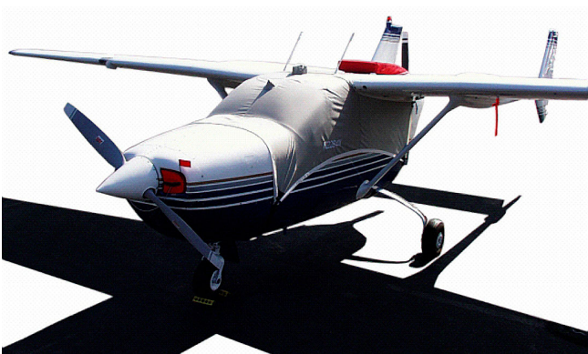
Cessna Skymaster Canopy Cover with Forward Extension, Fwd. Engine Plugs, Aft Engine Cover