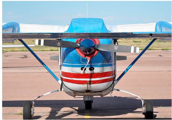
Cessna 337 Skymaster Aft Engine Inlet Plugs

Engine Inlet Plugs are custom fit for your Cessna 336 (Fixed Gear Skymaster) intakes, made with heavy-duty vinyl material, and stuffed with a single block of sculpted urethane foam. Each plug has a zipper that allows the foam to be removed and dried if necessary. Engine plugs have warning flags that are visible from the cockpit or 'remove before flight' streamers sewn onto the face of the plugs. Most plugs are imprinted with the aircraft registration number in black for an extra charge. Storage bag NOT included. Engine plugs may be inserted after flight when the engine is still warm. Engine Inlet Plugs are commonly referred to as Cowl Plugs, Intake Plugs, Cowl Blocks, Engine Blocks, and Engine Bungs.