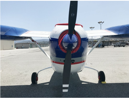
Cessna 337 Skymaster Rear Engine Plugs, Rear Engine Inlet Cover (SOLD SEPARATELY)