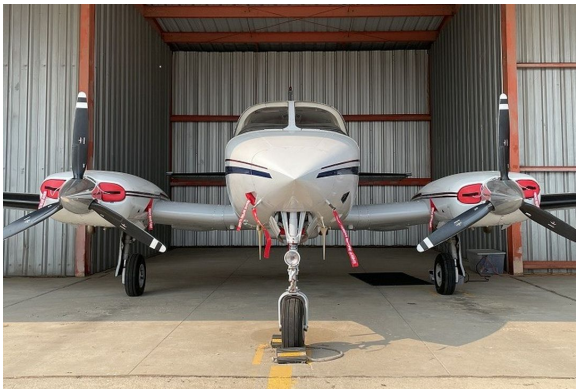
Cessna 340 Engine Plugs, Pitot Covers