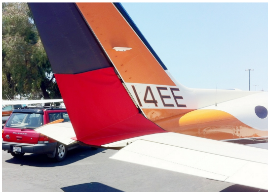
Cessna 414 Rudder Openings Cover (bird barrier)

WINTER USE MATERIAL - Made with Solution-Dyed Polyester fabric, this option is intended for seasonal use to aid in deicing, rain mitigation, or for occasional travel. The material is lighter and more compact, but more susceptible to UV damage and may have a shorter useful life if used continuously outside than the all-year use material.