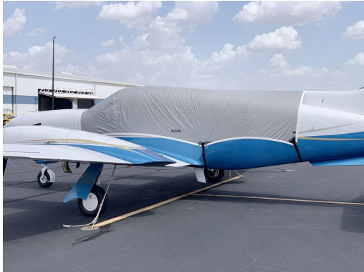
Cessna 414 Travel Weight Canopy Cover