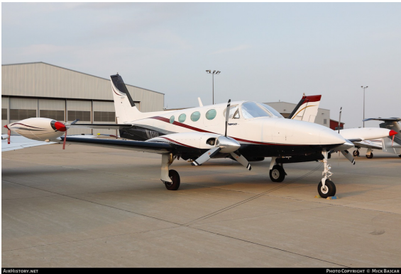
Cessna 340 Wingtip Pads