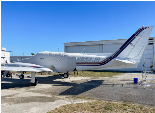
Cessna 340 Extended Canopy/Nose Cover

This cover type is made from Silver Acrylic Sunbrella canvas and is 100% lined with a soft and smooth microfiber. Bruce's Custom Covers developed this material combination especially for aircraft protection. The outer material is medium weight and treated for water resistance, UV resistance and anti-static buildup. The inner lining is a very soft and smooth microfiber to prevent scratching. The material is very reflective, and tests show that the cabin interior temperature can be reduced to near-ambient temperature on the hottest of days. It is water, ice and snow repellent, yet breathable to allow moisture to escape from between the cover and the aircraft surface.