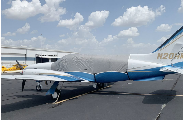
Cessna 414 Travel Weight Canopy Cover

Travel Covers are made with Silver Solution-Dyed Polyester fabric and only lined over the windshield to save weight. The material is lightweight and more compact for easy stowage in the aircraft. The polyester material is water resistant, but only intended for occasional use outside. We also have an ultra lightweight material available for fitted hangar dust covers. For daily outdoor use, the non-travel Sunbrella Cover is the best choice.