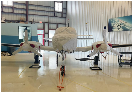
Cessna 340 Extended Canopy/Nose Cover

This cover type is made from Silver Acrylic Sunbrella canvas and is 100% lined with a soft and smooth microfiber. Bruce's Custom Covers developed this material combination especially for aircraft protection. The outer material is medium weight and treated for water resistance, UV resistance and anti-static buildup. The inner lining is a very soft and smooth microfiber to prevent scratching. The material is very reflective, and tests show that the cabin interior temperature can be reduced to near-ambient temperature on the hottest of days. It is water, ice and snow repellent, yet breathable to allow moisture to escape from between the cover and the aircraft surface.