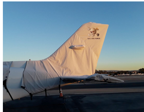
Cessna 421 Empennage Cover