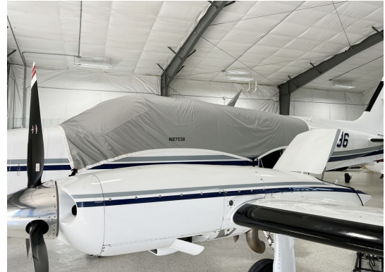
Cessna 340A Travel Weight Canopy Cover