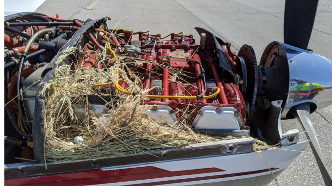
Cessna 340 Engine Inlet Plugs