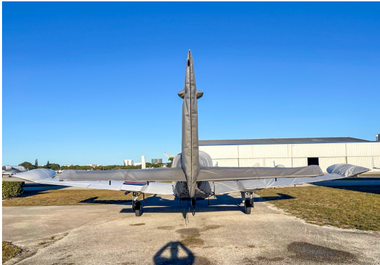
Cessna 340 Empennage Cover, Wing/Engine Covers

WINTER USE MATERIAL - Made with Solution-Dyed Polyester fabric, this option is intended for seasonal use to aid in deicing, rain mitigation, or for occasional travel. The material is lighter and more compact, but more susceptible to UV damage and may have a shorter useful life if used continuously outside than the all-year use material.