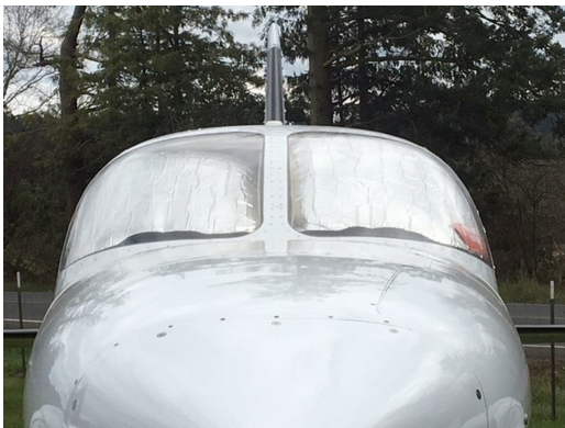
Cessna 421 Windshield HeatShields

Cockpit Heatshields are interior sunshades for the aircraft's cockpit. The product is a unique composite of closed-cell foam with a silver mylar finish. The semi-rigid design is stiff enough to stand inside the window framing. The set folds up flat and is easily stored in the included storage sleeve. Some designs may require velcro and suction cups. A Heatshield is an excellent short-term remedy for cockpit overheating, but an external fabric cover is more effective for long-term protection.