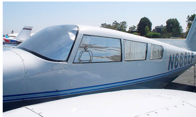
Piper PA-30 Twin Comanche Cockpit HeatShields