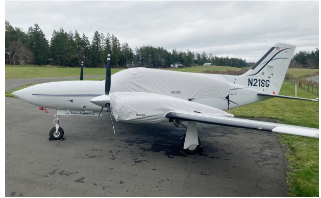
Cessna 421C Canopy & Engine Covers