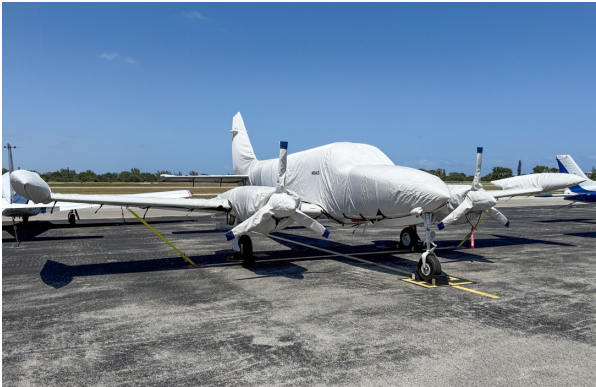
Cessna 340 Complete Cover Set