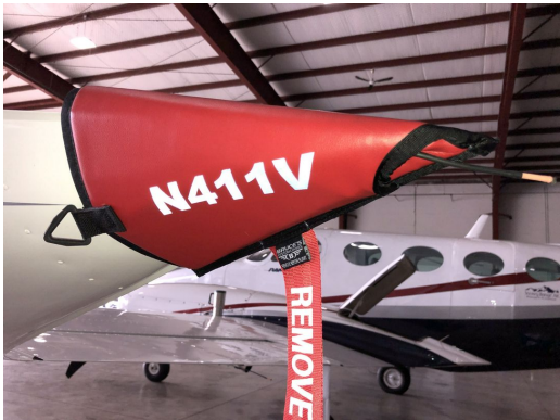
Cessna 335, 340 Wingtip Pads

Designed to prevent damage to the aircraft extremities in crowded hangars, these products are made of bright red Naugahyde and thickly padded with a sandwich of closed cell foam.