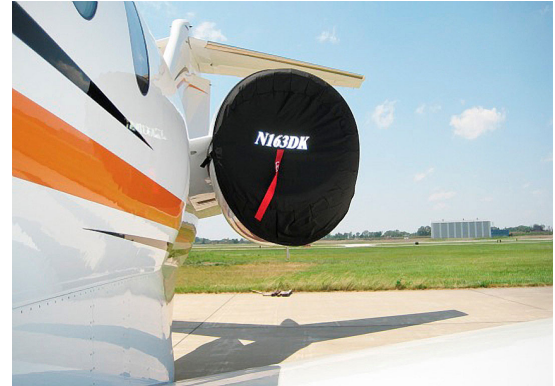
Hawker 4000 Intake Cover