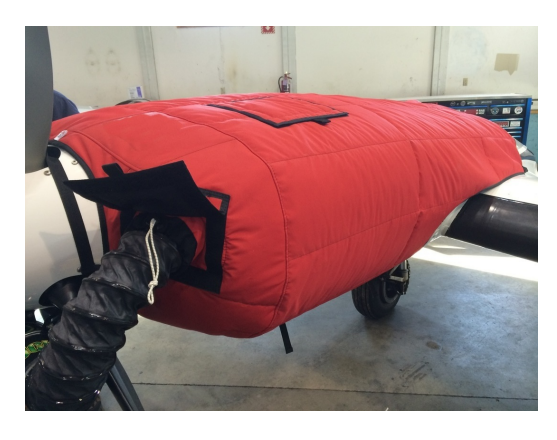
Cessna 402 Insulated Engine Cover with Heater