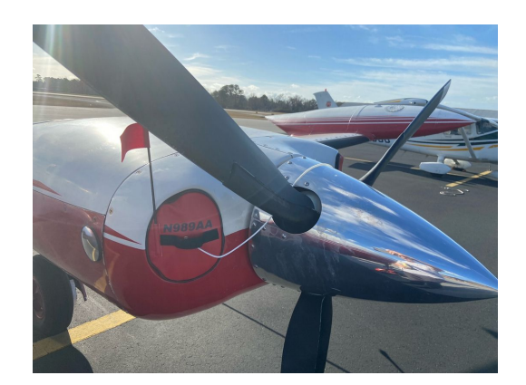
Cessna 401A Engine Inlet Plugs