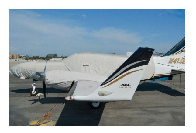
Cessna 414 Extended Canopy/Nose Cover, Engine Covers