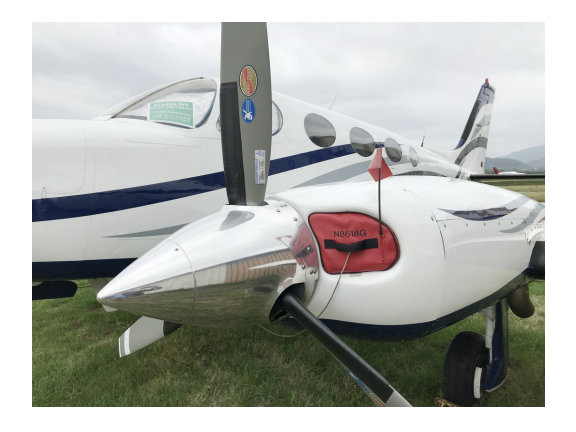
Cessna 340 Engine Inlet Plugs

Engine Inlet Plugs are custom fit for your Cessna 401 intakes, made with heavy-duty vinyl material, and stuffed with a single block of sculpted urethane foam. Each plug has a zipper that allows the foam to be removed and dried if necessary. Engine plugs have warning flags that are visible from the cockpit or 'remove before flight' streamers sewn onto the face of the plugs. Most plugs are imprinted with the aircraft registration number in black for an extra charge. Storage bag NOT included. Engine plugs may be inserted after flight when the engine is still warm. Engine Inlet Plugs are commonly referred to as Cowl Plugs, Intake Plugs, Cowl Blocks, Engine Blocks, and Engine Bungs.