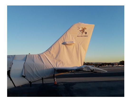
Cessna 421 Empennage Cover