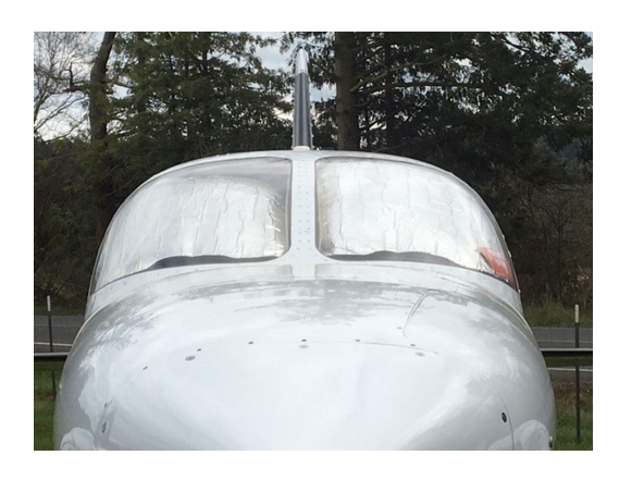
Cessna 421 Windshield HeatShields