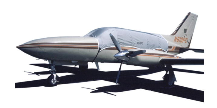
Cessna 421 Cockpit/Windshield Cover