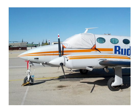
Cessna 340 Cockpit/Windshield Cover

Travel Covers are made with Silver Solution-Dyed Polyester fabric and only lined over the windshield to save weight. The material is lightweight and more compact for easy stowage in the aircraft. The polyester material is water resistant, but only intended for occasional use outside. We also have an ultra lightweight material available for fitted hangar dust covers. For daily outdoor use, the non-travel Sunbrella Cover is the best choice.