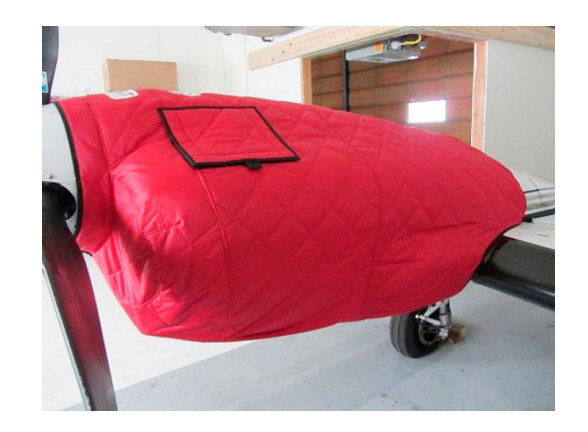
Cessna 421 Insulated Engine Covers