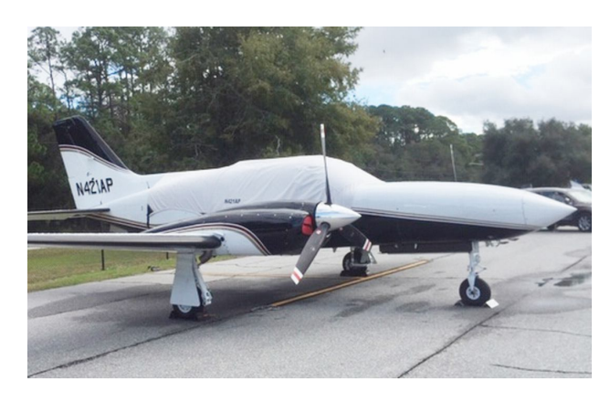
Cessna 421 Canopy Cover, Engine Plugs