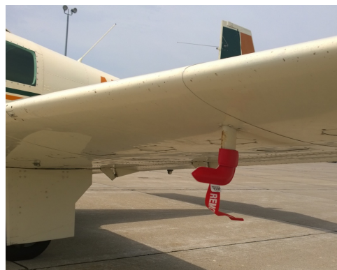
Mooney Pitot Cover