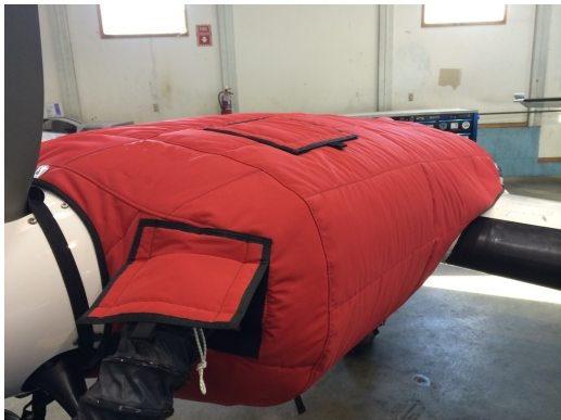
Cessna 402 Insulated Engine Cover with Heater

This cover type is made from Silver Acrylic Sunbrella canvas and is 100% lined with a soft and smooth microfiber. Bruce's Custom Covers developed this material combination especially for aircraft protection. The outer material is medium weight and treated for water resistance, UV resistance and anti-static buildup. The inner lining is a very soft and smooth microfiber to prevent scratching. The material is very reflective, and tests show that the cabin interior temperature can be reduced to near-ambient temperature on the hottest of days. It is water, ice and snow repellent, yet breathable to allow moisture to escape from between the cover and the aircraft surface.