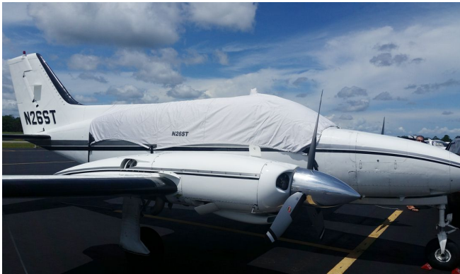
Cessna 414 Canopy Cover

The Cessna 402 Nose Cover is designed to cover the section of the fuselage forward of the windshield to the tip of the nose. It is secured with belly strapsThis cover type is made from Silver Acrylic Sunbrella canvas and is 100% lined with a soft and smooth microfiber. Bruce's Custom Covers developed this material combination especially for aircraft protection. The outer material is medium weight and treated for water resistance, UV resistance and anti-static buildup. The inner lining is a very soft and smooth microfiber to prevent scratching. The material is very reflective, and tests show that the cabin interior temperature can be reduced to near-ambient temperature on the hottest of days. It is water, ice and snow repellent, yet breathable to allow moisture to escape from between the cover and the aircraft surface.