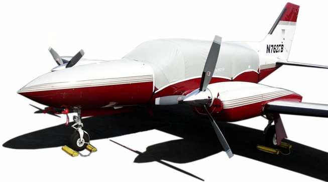
Cessna 421C Canopy Cover & Engine Plugs