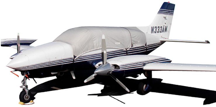
Cessna 414 Canopy Cover & Pitot Covers