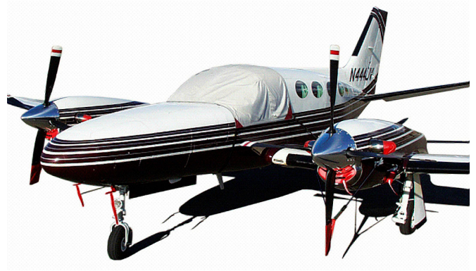
Cessna 425 Cockpit Cover