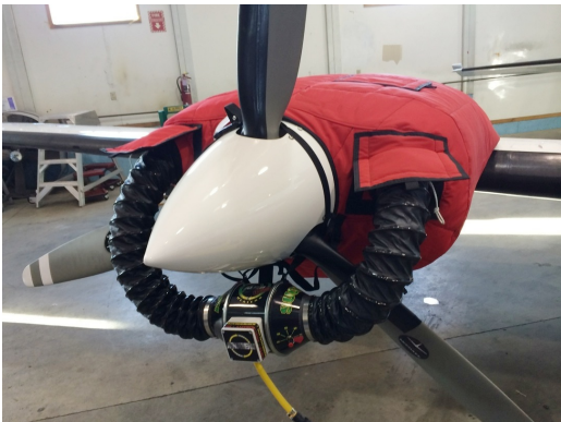
Cessna 402 Insulated Engine Cover with Heater