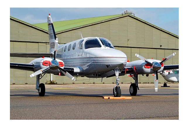
Cessna 340 Engine Plugs