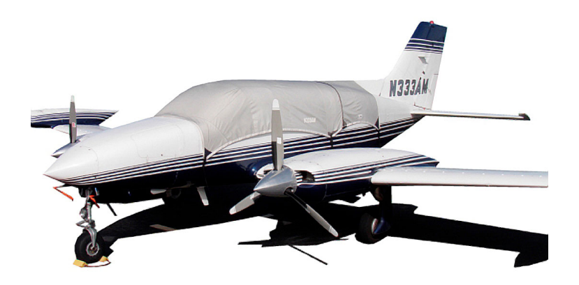
Cessna 414 Canopy Cover & Pitot Covers

This cover type is made from Silver Acrylic Sunbrella canvas and is 100% lined with a soft and smooth microfiber. Bruce's Custom Covers developed this material combination especially for aircraft protection. The outer material is medium weight and treated for water resistance, UV resistance and anti-static buildup. The inner lining is a very soft and smooth microfiber to prevent scratching. The material is very reflective, and tests show that the cabin interior temperature can be reduced to near-ambient temperature on the hottest of days. It is water, ice and snow repellent, yet breathable to allow moisture to escape from between the cover and the aircraft surface.