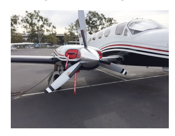
Cessna 414 Engine Inlet Plugs

Engine Inlet Plugs are custom fit for your Cessna 404 Titan, F406 Caravan II intakes, made with heavy-duty vinyl material, and stuffed with a single block of sculpted urethane foam. Each plug has a zipper that allows the foam to be removed and dried if necessary. Engine plugs have warning flags that are visible from the cockpit or 'remove before flight' streamers sewn onto the face of the plugs. Most plugs are imprinted with the aircraft registration number in black for an extra charge. Storage bag NOT included. Engine plugs may be inserted after flight when the engine is still warm. Engine Inlet Plugs are commonly referred to as Cowl Plugs, Intake Plugs, Cowl Blocks, Engine Blocks, and Engine Bungs.