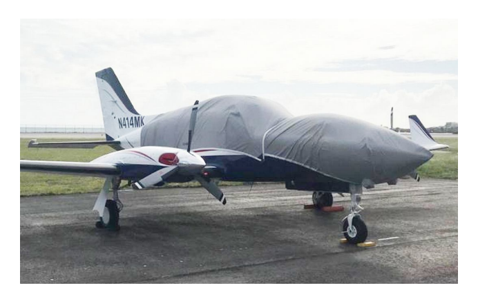
Cessna 414 Travel Cover, Light Weight Canopy Cover