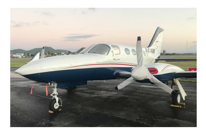
Cessna 414 Propellor/Spinner Covers, 3 Blade