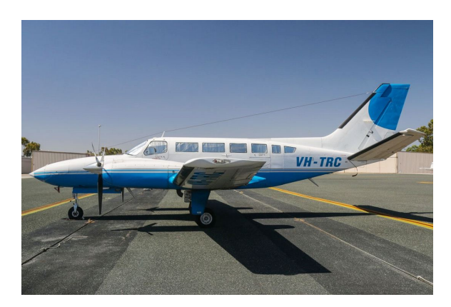
Cessna 404 & F406 HeatShields

window framing. It folds up flat and easily stores in the included storage sleeve. Some designs may require velcro and suction cups. A Heatshield is an excellent short-term remedy for cockpit overheating.