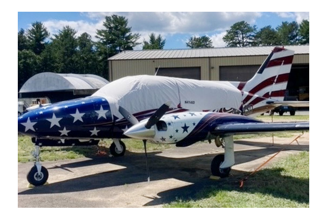
Cessna 414 Canopy Cover

This cover type is made from Silver Acrylic Sunbrella canvas and is 100% lined with a soft and smooth microfiber. Bruce's Custom Covers developed this material combination especially for aircraft protection. The outer material is medium weight and treated for water resistance, UV resistance and anti-static buildup. The inner lining is a very soft and smooth microfiber to prevent scratching. The material is very reflective, and tests show that the cabin interior temperature can be reduced to near-ambient temperature on the hottest of days. It is water, ice and snow repellent, yet breathable to allow moisture to escape from between the cover and the aircraft surface.