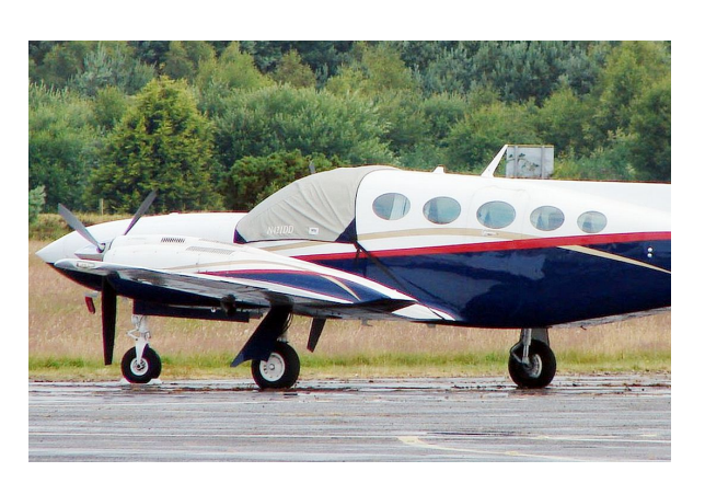
Cessna 421 Cockpit Cover