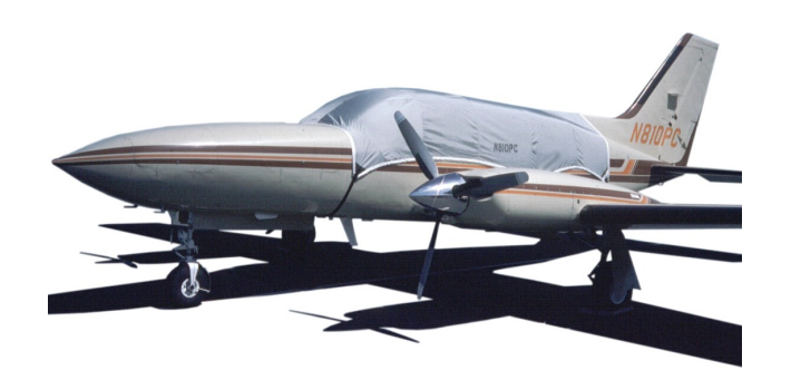
Cessna 425 Cockpit Cover