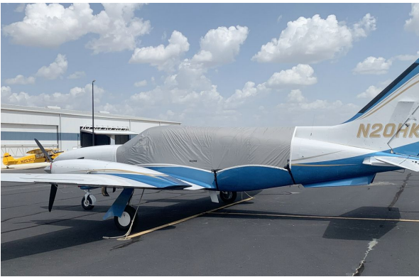
Cessna 414 Travel Weight Canopy Cover

Travel Covers are made with Silver Solution-Dyed Polyester fabric and only lined over the windshield to save weight. The material is lightweight and more compact for easy stowage in the aircraft. The polyester material is water resistant, but only intended for occasional use outside. We also have an ultra lightweight material available for fitted hangar dust covers. For daily outdoor use, the non-travel Sunbrella Cover is the best choice.