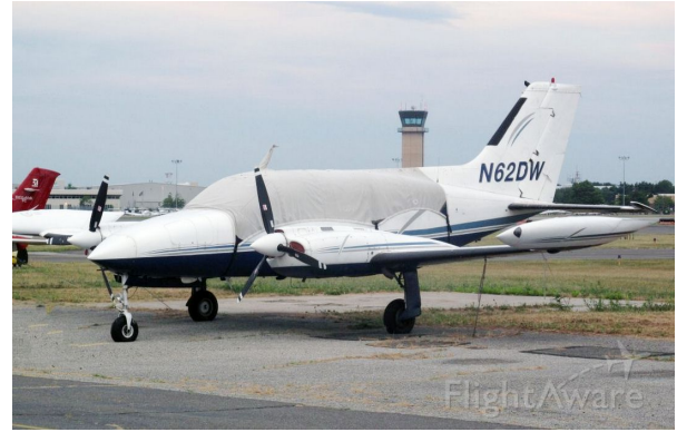
Cessna 421 Canopy Cover