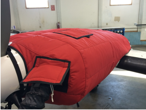
Cessna 402 Insulated Engine Cover with Heater

This cover type is made from Silver Acrylic Sunbrella canvas and is 100% lined with a soft and smooth microfiber. Bruce's Custom Covers developed this material combination especially for aircraft protection. The outer material is medium weight and treated for water resistance, UV resistance and anti-static buildup. The inner lining is a very soft and smooth microfiber to prevent scratching. The material is very reflective, and tests show that the cabin interior temperature can be reduced to near-ambient temperature on the hottest of days. It is water, ice and snow repellent, yet breathable to allow moisture to escape from between the cover and the aircraft surface.