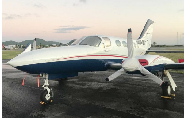
Cessna 414 Propellor/Spinner Covers, 3 Blade

Heatshields are interior sunshades for an aircraft's windows or canopy glass. The product is a unique composite of closed-cell foam with a silver mylar finish. The semi-rigid design is stiff enough to stand along the inside of the windshield using sun visors or window framing. It folds up flat and easily stores in the included storage sleeve. Some designs may require velcro and suction cups. A Heatshield is an excellent short-term remedy for cockpit overheating.