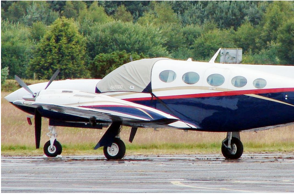
Cessna 421 Cockpit Cover

Covers developed this material combination especially for aircraft protection. The outer material is medium weight and treated for water resistance, UV resistance and anti-static buildup. The inner lining is a very soft and smooth microfiber to prevent scratching. The material is very reflective, and tests show that the cabin interior temperature can be reduced to near-ambient temperature on the hottest of days. It is water, ice and snow repellent, yet breathable to allow moisture to escape from between the cover and the aircraft surface.