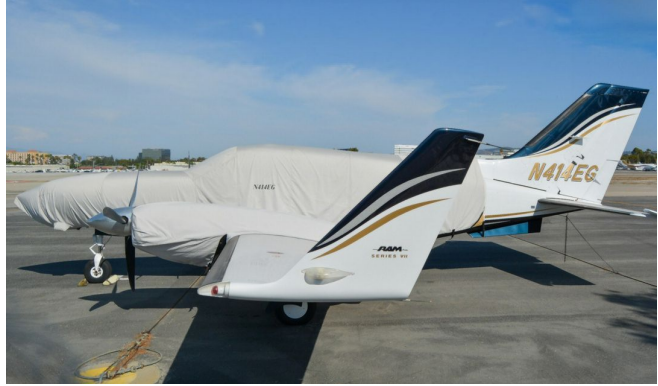
Cessna 414A Extended Canopy/Nose Cover & Engine Covers