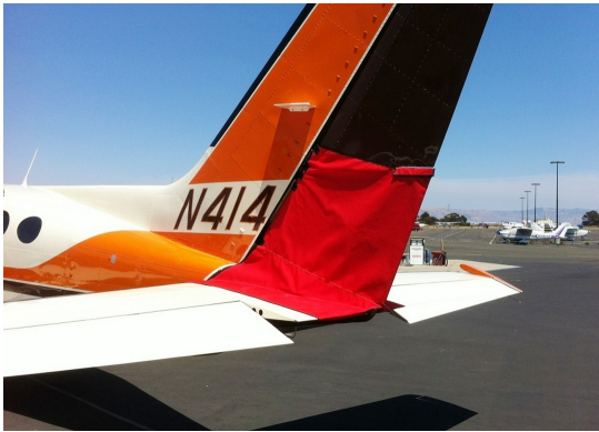
Cessna 414 Rudder Openings Cover (bird barrier)

WINTER USE MATERIAL - Made with Solution-Dyed Polyester fabric, this option is intended for seasonal use to aid in deicing, rain mitigation, or for occasional travel. The material is lighter and more compact, but more susceptible to UV damage and may have a shorter useful life if used continuously outside than the all-year use material.