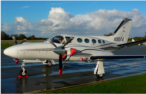
Cessna 425 Engine Plugs, Prop Tie/Exhaust Covers

plugs are imprinted with the aircraft registration number in black for an extra charge. Storage bag NOT included. Engine plugs may be inserted after flight when the engine is still warm. Engine Inlet Plugs are commonly referred to as Cowl Plugs, Intake Plugs, Cowl Blocks, Engine Blocks, and Engine Bungs.