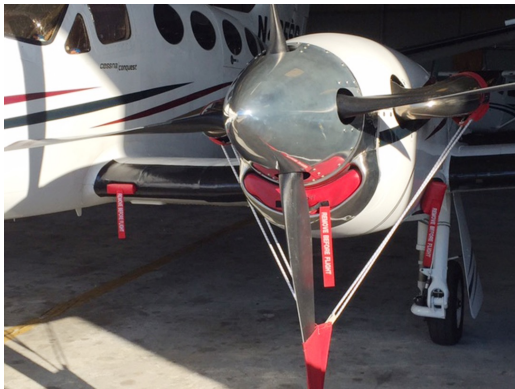
Cessna Conquest I Prop Tie/Exhaust Covers, Engine Plugs

This cover type is made from Silver Acrylic Sunbrella canvas and is 100% lined with a soft and smooth microfiber. Bruce's Custom Covers developed this material combination especially for aircraft protection. The outer material is medium weight and treated for water resistance, UV resistance and anti-static buildup. The inner lining is a very soft and smooth microfiber to prevent scratching. The material is very reflective, and tests show that the cabin interior temperature can be reduced to near-ambient temperature on the hottest of days. It is water, ice and snow repellent, yet breathable to allow moisture to escape from between the cover and the aircraft surface.