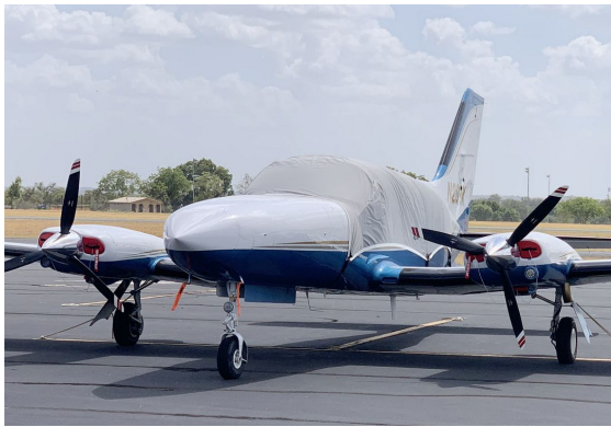
Cessna 414 Travel Weight Canopy Cover, Engine Plugs

Travel Covers are made with Silver Solution-Dyed Polyester fabric and only lined over the windshield to save weight. The material is lightweight and more compact for easy stowage in the aircraft. The polyester material is water resistant, but only intended for occasional use outside. We also have an ultra lightweight material available for fitted hangar dust covers. For daily outdoor use, the non-travel Sunbrella Cover is the best choice.