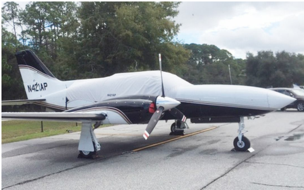
Cessna 421 Canopy Cover, Engine Plugs