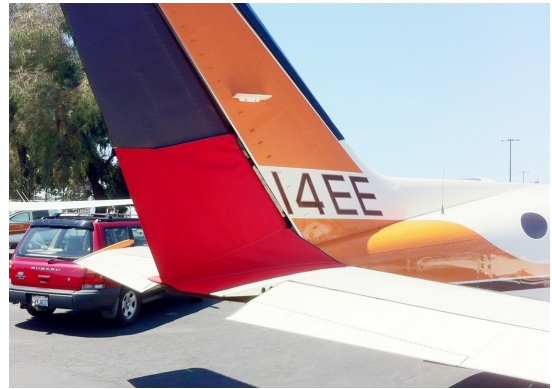
Cessna 414 Rudder Openings Cover (bird barrier)