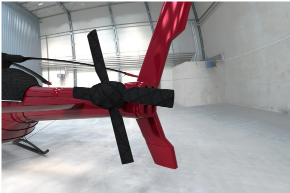
Bell 429 Tail Rotor Cover