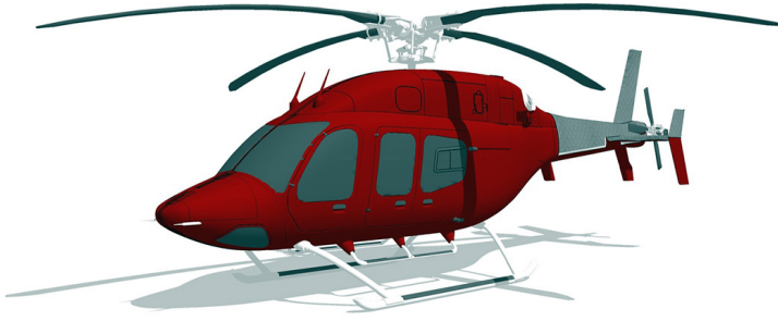
Bell 429 Insulated Tailboom Cover