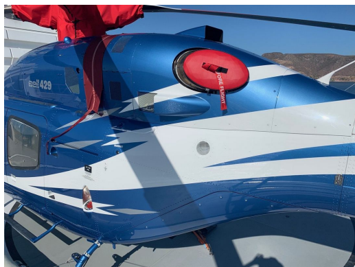
Bell 429 Exhaust Plug

The Engine Exhaust Plugs are custom fit for your Bell 429 exhaust openings, made with heavy-duty vinyl material, and stuffed with a single block of sculpted urethane foam. Exhaust plugs have 'Remove Before Flight' streamers sewn onto the face of the plugs. Exhaust plugs may be inserted soon after flight when the engine is still warm. Engine Inlet Plugs are commonly referred to as Cowl Plugs, Intake Plugs, Cowl Blocks, Engine Blocks, and Engine Bunges.