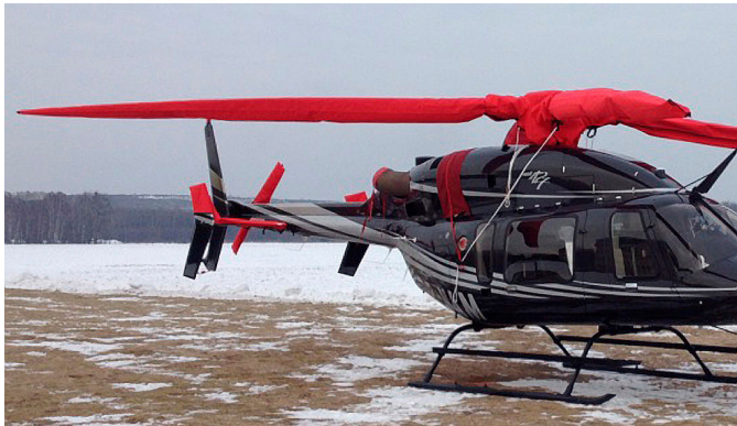
Bell 427 Rotor Blades, Main Rotor Hub/Drive Shafts, Horiz. Stabs, Tail Rotor Covers

WINTER USE MATERIAL - Made with Solution-Dyed Polyester fabric, this option is intended for seasonal use to aid in deicing, rain mitigation, or for occasional travel. The material is lighter and more compact, but more susceptible to UV damage and may have a shorter useful life if used continuously outside than the all-year use material.