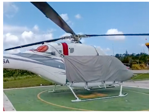
Bell 429 Bubble Cover