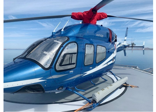
Bell 429 Rotor Hub Cover, Cockpit & Cabin HeatShields