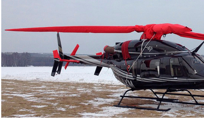
Bell 427 Rotor Blades, Main Rotor Hub/Drive Shafts, Horiz. Stabs, Tail Rotor Covers

WINTER USE MATERIAL - Made with Solution-Dyed Polyester fabric, this option is intended for seasonal use to aid in deicing, rain mitigation, or for occasional travel. The material is lighter and more compact, but more susceptible to UV damage and may have a shorter useful life if used continuously outside than the all-year use material.