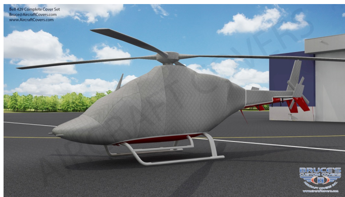
Bell 429 Full Cover Set (3D rendering)