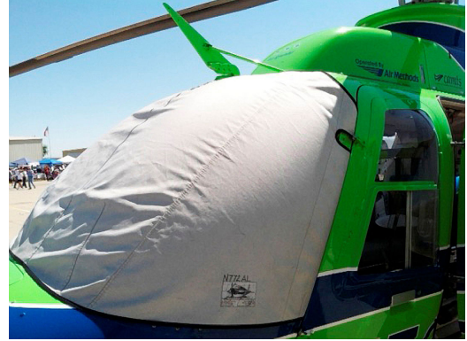
Bell 407 Windshield Cover