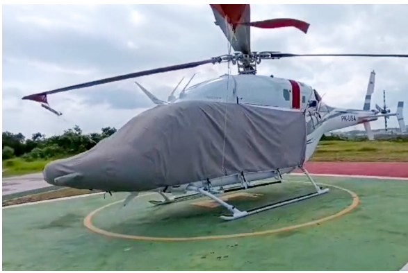
Bell 429 Bubble Cover