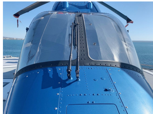
Bell 429 Windshield HeatShields