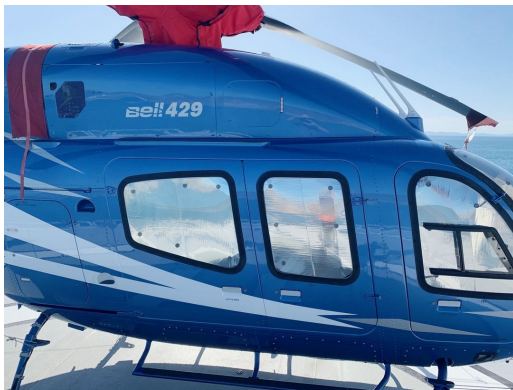
Bell 429 Cockpit & Cabin HeatShields

Cockpit Heatshields are interior sunshades for the aircraft's cockpit. The product is a unique composite of closed-cell foam with a silver mylar finish. The semi-rigid design is stiff enough to stand inside the window framing. Darts and folds are incorporated into the material so that it conforms to the complex shape of the helicopter windows. The set folds up flat and is easily stored in the included storage sleeve. Some designs may require velcro and suction cups. A Heatshield is an excellent short-term remedy for cockpit overheating, but an external fabric cover is more effective for long-term protection.