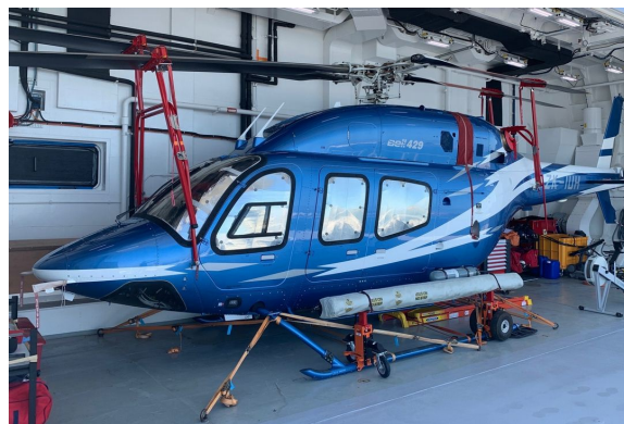
Bell 429 Cockpit & Cabin HeatShields