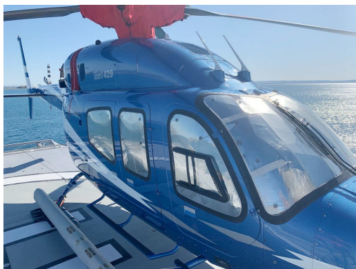
Bell 429 Cockpit & Cabin HeatShields

Cockpit Heatshields are interior sunshades for the aircraft's cockpit. The product is a unique composite of closed-cell foam with a silver mylar finish. The semi-rigid design is stiff enough to stand inside the window framing. Darts and folds are incorporated into the material so that it conforms to the complex shape of the helicopter windows. The set folds up flat and is easily stored in the included storage sleeve. Some designs may require velcro and suction cups. A Heatshield is an excellent short-term remedy for cockpit overheating, but an external fabric cover is more effective for long-term protection.