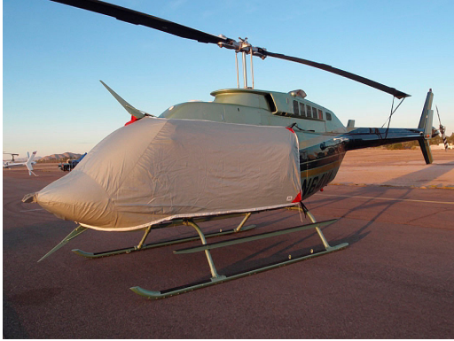
Bell 206L Longranger Bubble Cover

Travel Covers are made with Silver Solution-Dyed Polyester fabric and fully lined over the entire cover. The material is lightweight and more compact for easy stowage in the aircraft. The polyester material is water resistant, but only intended for occasional use outside. We also have an ultra lightweight material available for fitted hangar dust covers. For daily outdoor use, the non-travel Sunbrella Cover is the best choice.