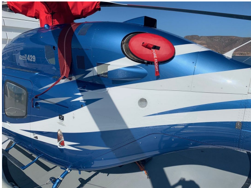
Bell 429 Exhaust Plug

The Engine Exhaust Plugs are custom fit for your Bell 429 exhaust openings, made with heavy-duty vinyl material, and stuffed with a single block of sculpted urethane foam. Exhaust plugs have 'Remove Before Flight' streamers sewn onto the face of the plugs. Exhaust plugs may be inserted soon after flight when the engine is still warm. Engine Inlet Plugs are commonly referred to as Cowl Plugs, Intake Plugs, Cowl Blocks, Engine Blocks, and Engine Bungs.