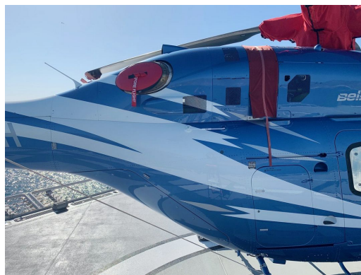
Bell 429 Exhaust Plug, Rotor Mast Cover