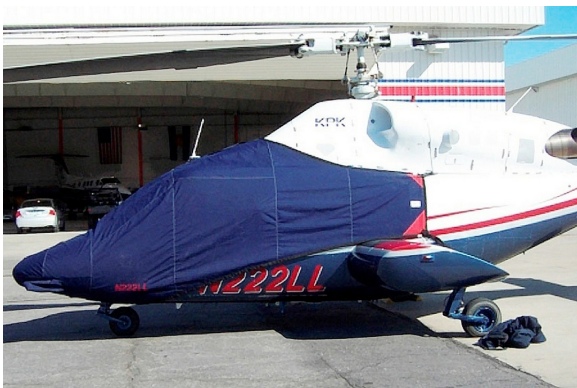
Bell 222 Bubble Cover

This cover type is made from Silver Acrylic Sunbrella canvas and is 100% lined with a soft and smooth microfiber. Bruce's Custom Covers developed this material combination especially for aircraft protection. The outer material is medium weight and treated for water resistance, UV resistance and anti-static buildup. The inner lining is a very soft and smooth microfiber to prevent scratching. The material is very reflective, and tests show that the cabin interior temperature can be reduced to near-ambient temperature on the hottest of days. It is water, ice and snow repellent, yet breathable to allow moisture to escape from between the cover and the aircraft surface.