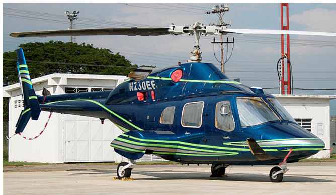
Bell 230 Engine Plugs, HeatShields