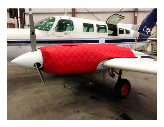
Cessna 402 Insulated Engine Cover