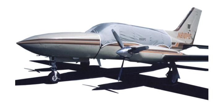
Cessna 421 Cockpit/Windshield Cover