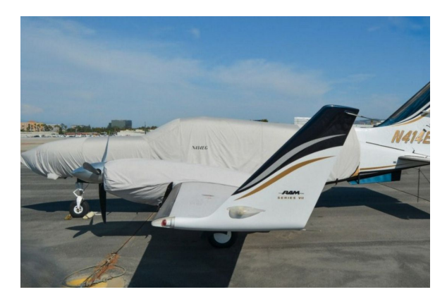
Cessna 414 Extended Canopy/Nose Cover, Engine Covers