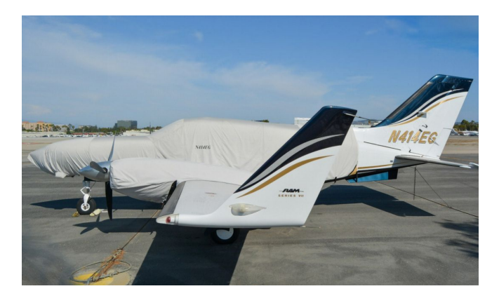
Cessna 414A Extended Canopy/Nose Cover & Engine Covers

This cover type is made from Silver Acrylic Sunbrella canvas and is 100% lined with a soft and smooth microfiber. Bruce's Custom Covers developed this material combination especially for aircraft protection. The outer material is medium weight and treated for water resistance, UV resistance and anti-static buildup. The inner lining is a very soft and smooth microfiber to prevent scratching. The material is very reflective, and tests show that the cabin interior temperature can be reduced to near-ambient temperature on the hottest of days. It is water, ice and snow repellent, yet breathable to allow moisture to escape from between the cover and the aircraft surface.