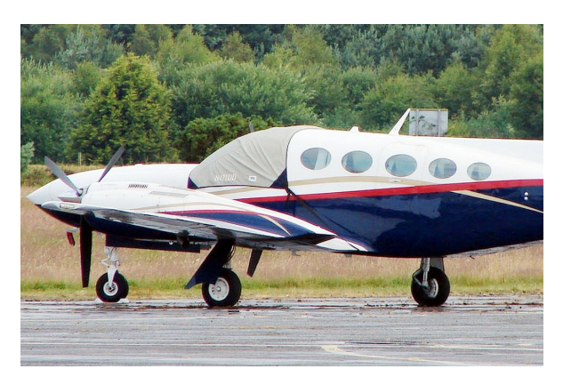
Cessna 421 Cockpit Cover

Covers developed this material combination especially for aircraft protection. The outer material is medium weight and treated for water resistance, UV resistance and anti-static buildup. The inner lining is a very soft and smooth microfiber to prevent scratching. The material is very reflective, and tests show that the cabin interior temperature can be reduced to near-ambient temperature on the hottest of days. It is water, ice and snow repellent, yet breathable to allow moisture to escape from between the cover and the aircraft surface.