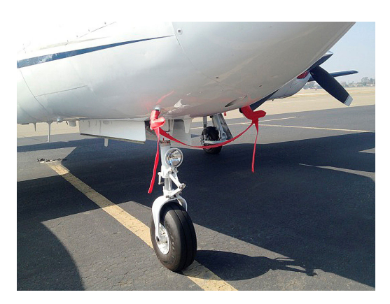
Cessna 421 Pltot Covers set