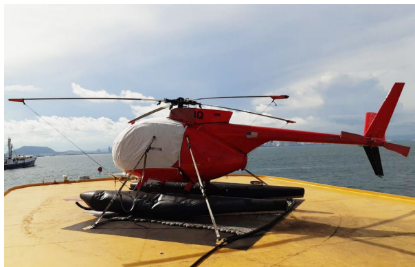
Hughes 500C (369HS) Bubble Cover, Blade Tie-Downs

WINTER USE MATERIAL - Made with Solution-Dyed Polyester fabric, this option is intended for seasonal use to aid in deicing, rain mitigation, or for occasional travel. The material is lighter and more compact, but more susceptible to UV damage and may have a shorter useful life if used continuously outside than the all-year use material.