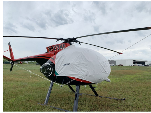
Hughes 500C Bubble Cover with Intake Add-On