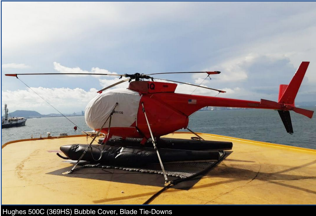
Hughes 500C (369HS) Bubble Cover, Blade Tie-Downs