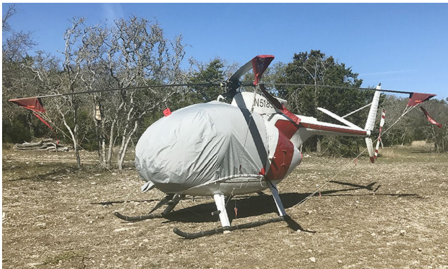
Hughes 500C, OH-6A Bubble Cover

WINTER USE MATERIAL - Made with Solution-Dyed Polyester fabric, this option is intended for seasonal use to aid in deicing, rain mitigation, or for occasional travel. The material is lighter and more compact, but more susceptible to UV damage and may have a shorter useful life if used continuously outside than the all-year use material.