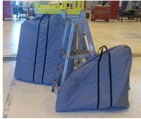
Eurocopter EC-145 Padded Bags for Removable Doors