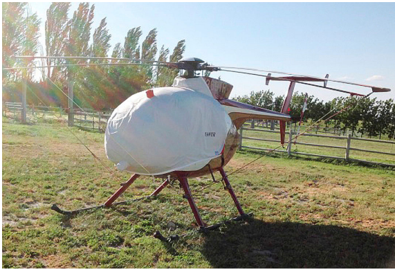
MD500D Bubble Cover with Intake Add-On