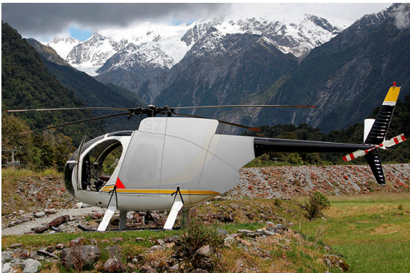
Engine Cover (illustration)