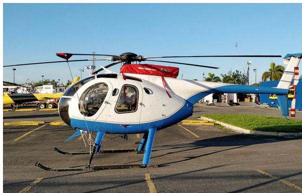
Hughes 500D Blade Tie-Downs, Doghouse Cover