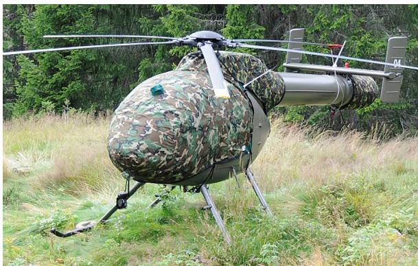
MD520 NOTAR Bubble, Engine, & NOTAR Covers & Blade Tie-downs

Travel Covers are made with Silver Solution-Dyed Polyester fabric and fully lined over the entire cover. The material is lightweight and more compact for easy storage in the aircraft. The polyester material is water resistant, but only intended for occasional use outside. We also have an ultra lightweight material available for fitted hangar dust covers. For daily outdoor use, the non-travel Sunbrella Cover is the best choice.