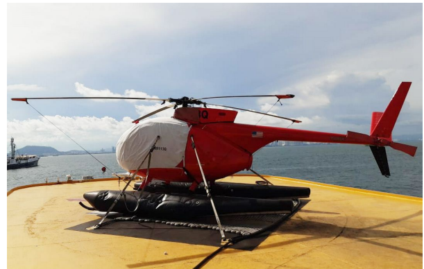
Hughes 500C (369HS) Bubble Cover, Blade Tie-Downs