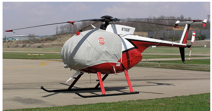
Hughes 500D Bubble Cover with Wire Strike detail and Blade Tie-downs