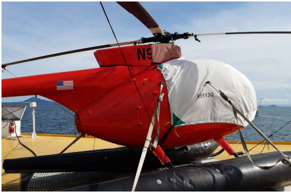
Hughes 500C (369HS) Bubble Cover