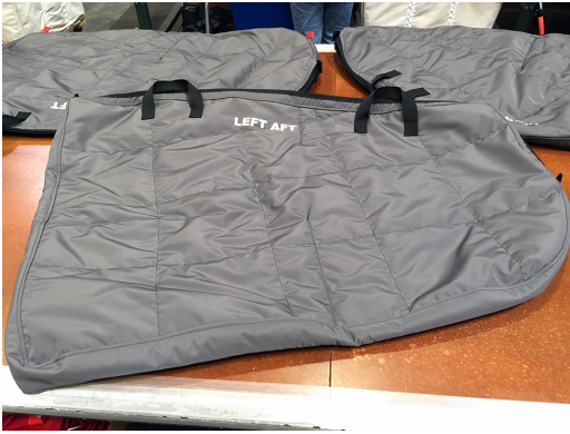
Protective Door Bags

**Padded Door Bags* are designed to provide portable protection of the doors when they are removed from the aircraft. They are padded to moderate thickness, zippered closed, and have sturdy carry handles for easy transport.