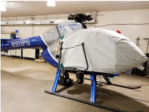
McDonnell Douglas MDD 520 Notar Bubble Cover, with special missions equipment.

Travel Covers are made with Silver Solution-Dyed Polyester fabric and fully lined over the entire cover. The material is lightweight and more compact for easy stowage in the aircraft. The polyester material is water resistant, but only intended for occasional use outside. We also have an ultra lightweight material available for fitted hangar dust covers. For daily outdoor use, the non-travel Sunbrella Cover is the best choice.