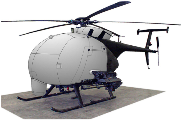
MH-6J Bubble, Flir & Doghouse Covers (illustration)

WINTER USE MATERIAL - Made with Solution-Dyed Polyester fabric, this option is intended for seasonal use to aid in deicing, rain mitigation, or for occasional travel. The material is lighter and more compact, but more susceptible to UV damage and may have a shorter useful life if used continuously outside than the all-year use material.