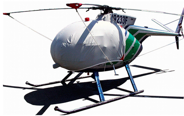
Hughes 500C Bubble Cover with Intake Add-on, Blade Tie-downs