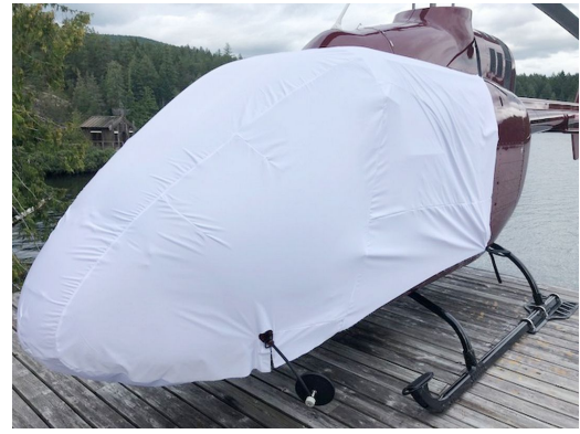
Bell 505 Bubble Cover, test fit cover