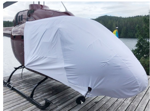
Bell 505 Bubble Cover, test fit cover