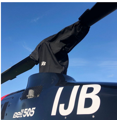
Bell 505 Rotor Mast & Blade Covers

WINTER USE MATERIAL - Made with Solution-Dyed Polyester fabric, this option is intended for seasonal use to aid in deicing, rain mitigation, or for occasional travel. The material is lighter and more compact, but more susceptible to UV damage and may have a shorter useful life if used continuously outside than the all-year use material.