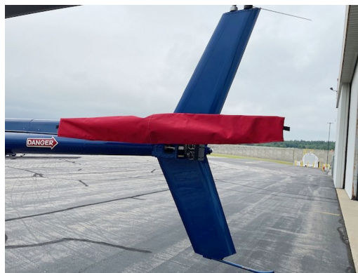
Bell 505 Jet Ranger X Tail Rotor Cover