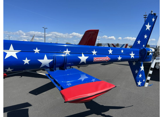
Bell 505 Horizontal Stabilizer Tip Pads