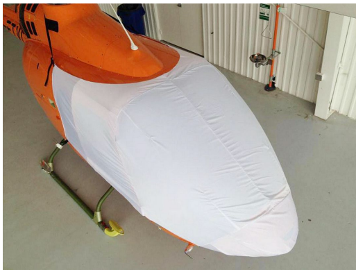
Bell 505 Bubble Cover, test fit cover.

Travel Covers are made with Silver Solution-Dyed Polyester fabric and fully lined over the entire cover. The material is lightweight and more compact for easy storage in the aircraft. The polyester material is water resistant, but only intended for occasional use outside. We also have an ultra lightweight material available for fitted hangar dust covers. For daily outdoor use, the non-travel Sunbrella Cover is the best choice.