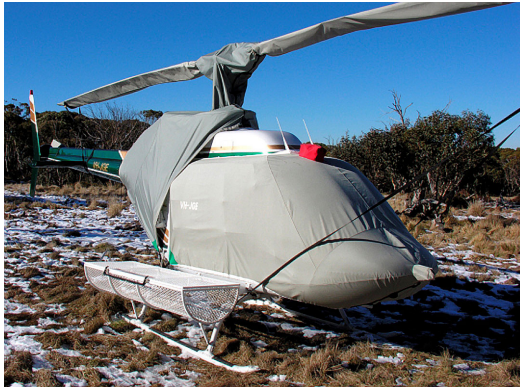
JetRanger Bubble, Engine, Rotor Hub & Blade Covers (& Tie-Downs)

The Engine Inlet Plugs are custom fit for your Bell 505 Jet Ranger X intakes, made with heavy-duty vinyl material, and stuffed with a single block of sculpted urethane foam. Each plug has a zipper that allows the foam to be removed and dried if necessary. Engine plugs have 'Remove Before Flight' streamers sewn onto the face of the plugs. Most plugs are imprinted with the aircraft registration number in black for an extra charge. Storage bag NOT included. Engine plugs may be inserted after flight when the engine is still warm. Engine Inlet Plugs are commonly referred to as Cowl Plugs, Intake Plugs, Cowl Blocks, Engine Blocks, and Engine Bungs.