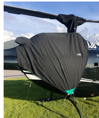
Bell 505 Engine, Rotor Mast & Blade Covers