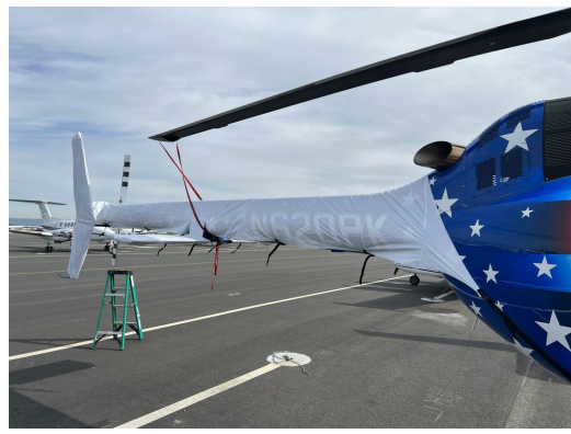
Bell 505 Tailboom & Stabilizer Covers, test fit cover