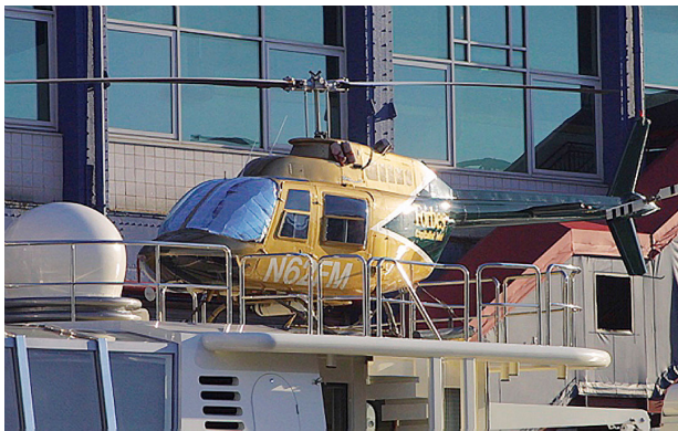
Bell 206B Jetranger Windshield HeatShields

Heatshields are interior sunshades for an aircraft's windows or canopy glass. The product is a unique composite of closed-cell foam with a silver mylar finish. The semi-rigid design is stiff enough to stand along the inside of the windshield using sun visors or window framing. It folds up flat and easily stores in the included storage sleeve. Some designs may require velcro and suction cups. A Heatshield is an excellent short-term remedy for cockpit overheating.