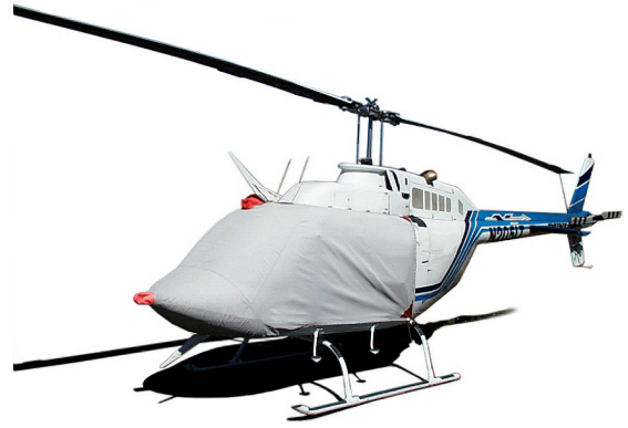
JetRanger Bubble Cover