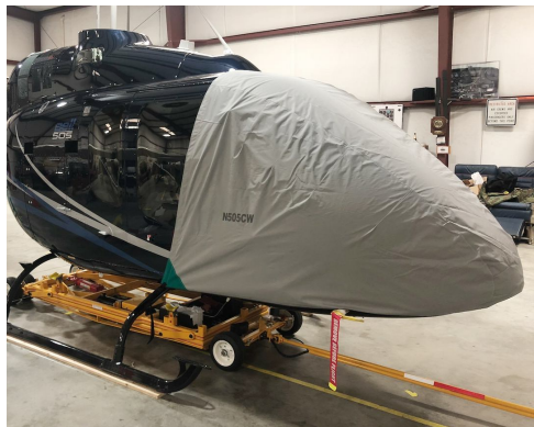
Bell 505 Bubble Cover, travel weight type

Travel Covers are made with Silver Solution-Dyed Polyester fabric and fully lined over the entire cover. The material is lightweight and more compact for easy storage in the aircraft. The polyester material is water resistant, but only intended for occasional use outside. We also have an ultra lightweight material available for fitted hangar dust covers. For daily outdoor use, the non-travel Sunbrella Cover is the best choice.