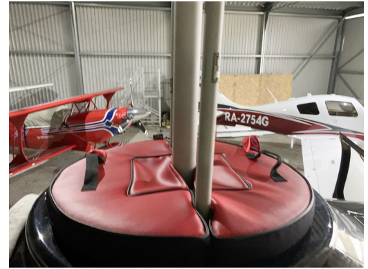
Bell 505 Jet Ranger X Swash Plate Plug