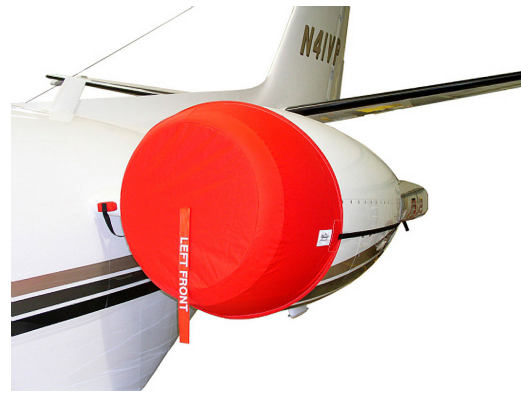
Citation Encore Intake Cover Set