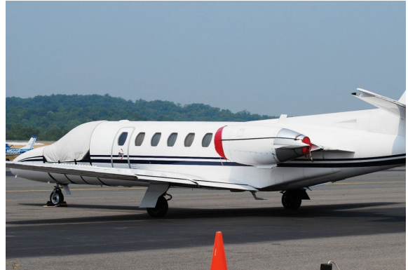
Cessna Citation S2 Cockpit Cover, Intake Covers & Exhaust Plugs