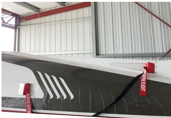
Beech Bonanza/Baron Fresh Air Intake & Exhaust Plugs