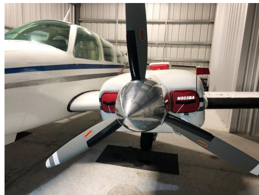
Beech Baron Engine Plugs