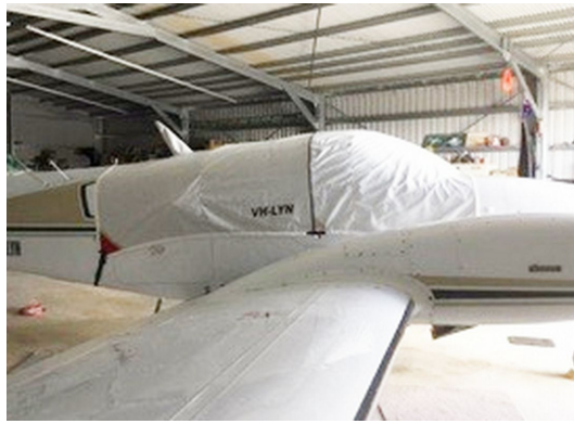
Beech Baron B-55 Canopy Cover