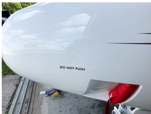
Beech Baron Nose Air Inlet Plugs, set of 2

Engine Inlet Plugs are custom fit for your Beech Baron 58TC intakes, made with heavy-duty vinyl material, and stuffed with a single block of sculpted urethane foam. Each plug has a zipper that allows the foam to be removed and dried if necessary. Engine plugs have warning flags that are visible from the cockpit or 'remove before flight' streamers sewn onto the face of the plugs. Most plugs are imprinted with the aircraft registration number in black for an extra charge. Storage bag NOT included. Engine plugs may be inserted after flight when the engine is still warm. Engine Inlet Plugs are commonly referred to as Cowl Plugs, Intake Plugs, Cowl Blocks, Engine Blocks, and Engine Bungs.