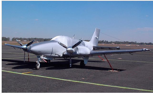
Baron FULL COVER SET, Light Weight Travel &/or Fitted Dust Cover Set