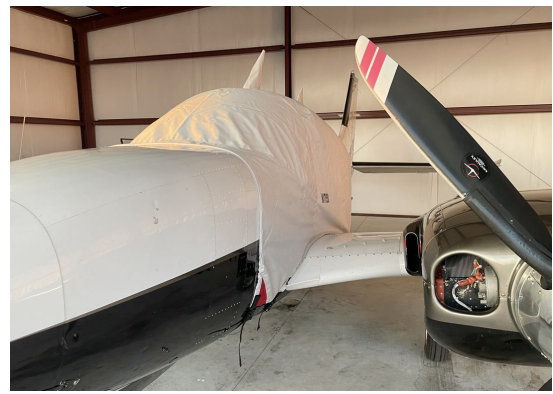
Beech Baron 58TC Extended Canopy Cover