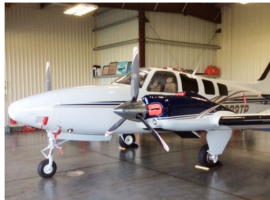
Beech Baron 58 Engine Inlet Plugs, Cowl Top Plugs, Heater Inlet, Pitot Cover