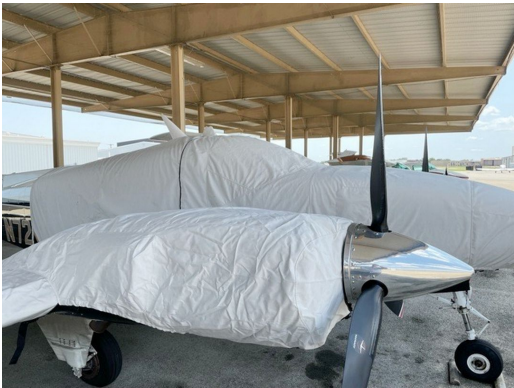
Beech Baron 58P Extended Canopy/Nose Cover, Wing/Engine Covers (test fit)

WINTER USE MATERIAL - Made with Solution-Dyed Polyester fabric, this option is intended for seasonal use to aid in deicing, rain mitigation, or for occasional travel. The material is lighter and more compact, but more susceptible to UV damage and may have a shorter useful life if used continuously outside than the all-year use material.