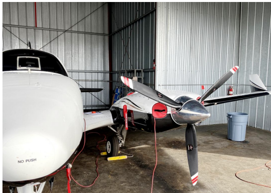
Baron 58 Engine Plugs

Engine Inlet Plugs are custom fit for your Beech Baron 58TC intakes, made with heavy-duty vinyl material, and stuffed with a single block of sculpted urethane foam. Each plug has a zipper that allows the foam to be removed and dried if necessary. Engine plugs have warning flags that are visible from the cockpit or 'remove before flight' streamers sewn onto the face of the plugs. Most plugs are imprinted with the aircraft registration number in black for an extra charge. Storage bag NOT included. Engine plugs may be inserted after flight when the engine is still warm. Engine Inlet Plugs are commonly referred to as Cowl Plugs, Intake Plugs, Cowl Blocks, Engine Blocks, and Engine Bungs.