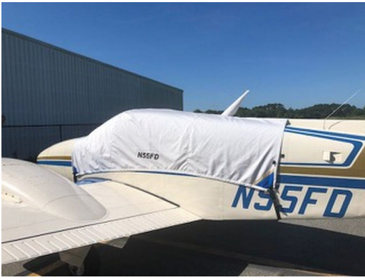
Beech Baron 95-B55 Canopy cover