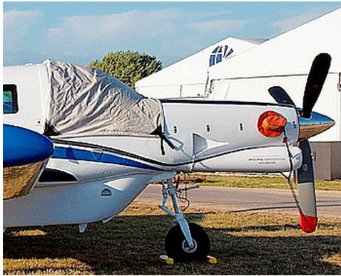
750XL Cockpit Cover & Prop Tie/Exhaust Covers

The material is very reflective, and tests show that the cabin interior temperature can be reduced to near-ambient temperature on the hottest of days. It is water, ice and snow repellent, yet breathable to allow moisture to escape from between the cover and the aircraft surface.