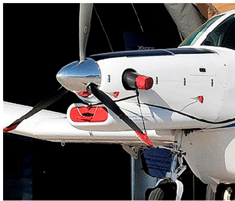
750XL Engine Inlet Plugs & Prop Tie/Exhaust Covers