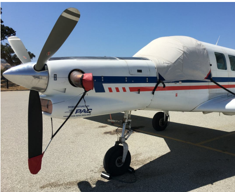
Pacific Aerospace 750XL Cockpit Cover, Prop Tie/Exhaust Covers