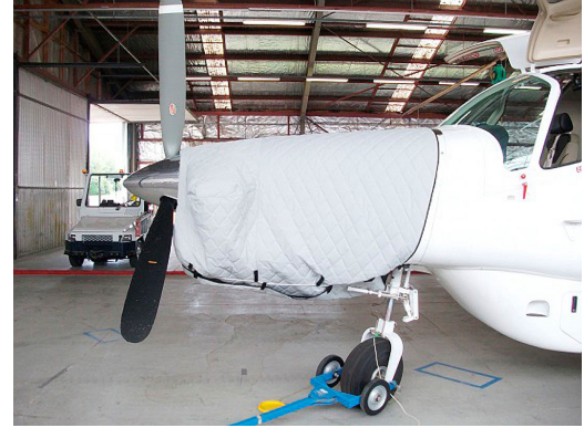
750XL Insulated Engine Cover