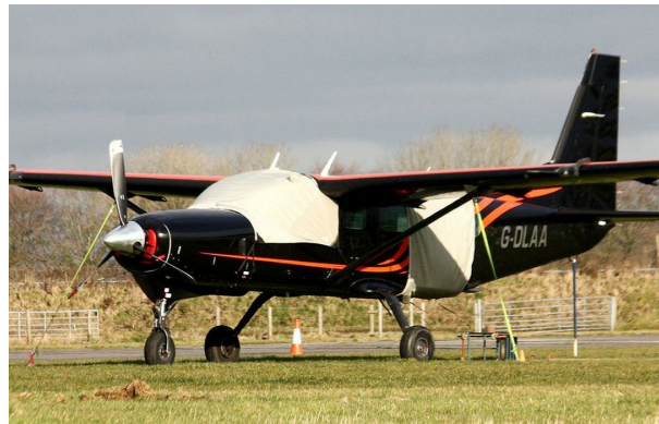
Cessna Caravan Cockpit Cover, Engine Plugs, Jump Door Cover