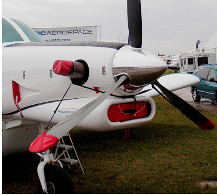
750XL Engine Inlet Plugs & Prop Tie/Exhaust Covers

This cover type is made from Silver Acrylic Sunbrella canvas and is 100% lined with a soft and smooth microfiber. Bruce's Custom Covers developed this material combination especially for aircraft protection. The outer material is medium weight and treated for water resistance, UV resistance and anti-static buildup. The inner lining is a very soft and smooth microfiber to prevent scratching. The material is very reflective, and tests show that the cabin interior temperature can be reduced to near-ambient temperature on the hottest of days. It is water, ice and snow repellent, yet breathable to allow moisture to escape from between the cover and the aircraft surface.