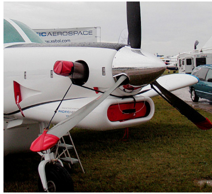
750XL Engine Inlet Plugs & Prop Tie/Exhaust Covers