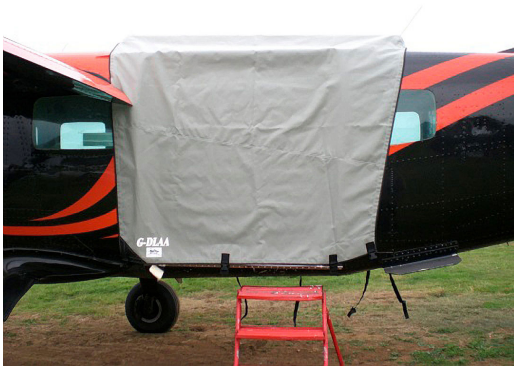
Cessna 208 Caravan Jump Door Cover