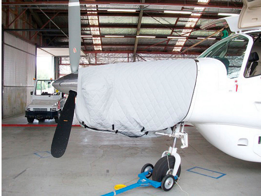
750XL Insulated Engine Cover

This cover type is made from Silver Acrylic Sunbrella canvas and is 100% lined with a soft and smooth microfiber. Bruce's Custom Covers developed this material combination especially for aircraft protection. The outer material is medium weight and treated for water resistance, UV resistance and anti-static buildup. The inner lining is a very soft and smooth microfiber to prevent scratching. The material is very reflective, and tests show that the cabin interior temperature can be reduced to near-ambient temperature on the hottest of days. It is water, ice and snow repellent, yet breathable to allow moisture to escape from between the cover and the aircraft surface.