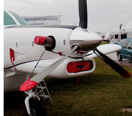
750XL Engine Inlet Plugs & Prop Tie/Exhaust Covers