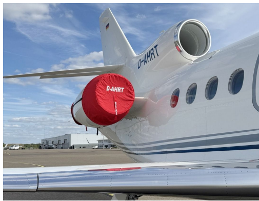
Falcon 900LX Engine Covers