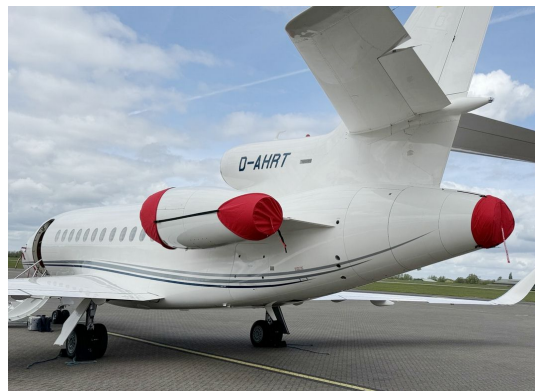
Falcon 900LX Engine Covers