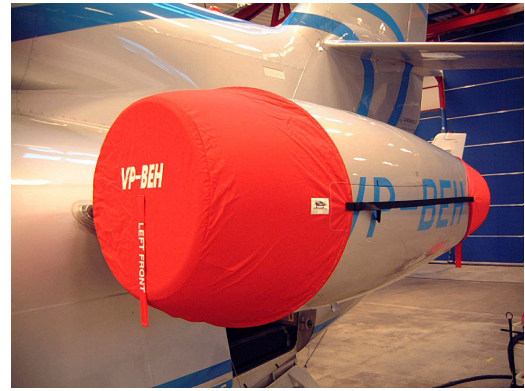
Falcon 900 Engine Covers, outboard & inboard strap detail