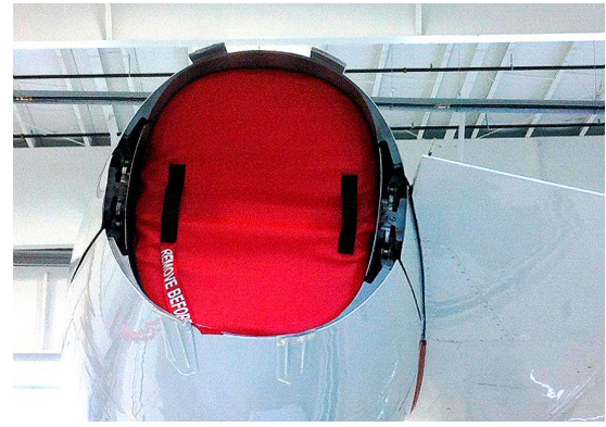
Falcon 2000EX Exhaust Plug