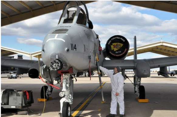
Fairchild A10 Intake Covers & Nose Gun Scoop Plug

The Engine Inlet Plugs are custom fit for your Fairchild A10 Thunderbolt intakes, made with heavy-duty vinyl material, and stuffed with a single block of sculpted urethane foam. Each plug has a zipper that allows the foam to be removed and dried if necessary. Engine plugs have 'remove before flight' streamers sewn onto the face of the plugs. Most plugs are imprinted with the aircraft registration number in black for an extra charge. Storage bag NOT included. Engine plugs may be inserted after flight when the engine is still warm. Engine Inlet Plugs are commonly referred to as Cowl Plugs, Intake Plugs, Cowl Blocks, Engine Blocks, and Engine Bungs.