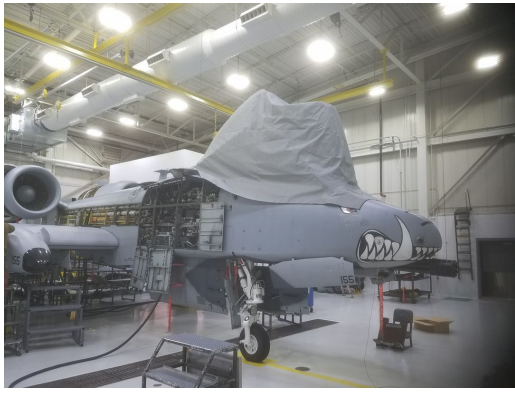
Fairchild A-10 Canopy Cover, open position