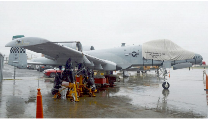
Fairchild A10 Thunderbolt Canopy Cover