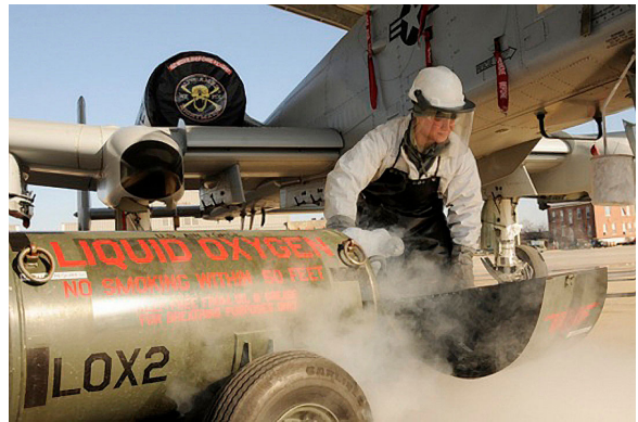
A-10 Engine Intake Cover