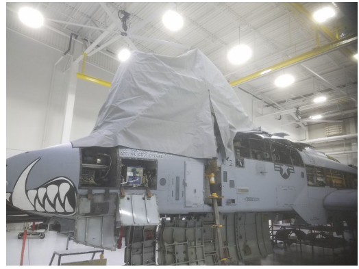
Fairchild A-10 Canopy Cover, open position