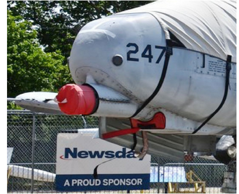
Fairchild A10 Thunderbolt Canopy Cover, Nose Gun Cover, Gun Scoop Inlet Plug Fairchild A10 Thunderbolt Nose Gun Cover, Gun Scoop Inlet Plug