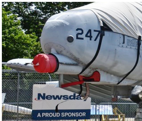
Fairchild A10 Thunderbolt Nose Gun Cover, Gun Scoop Inlet Plug

The Engine Inlet Plugs are custom fit for your Fairchild A10 Thunderbolt intakes, made with heavy-duty vinyl material, and stuffed with a single block of sculpted urethane foam. Each plug has a zipper that allows the foam to be removed and dried if necessary. Engine plugs have 'remove before flight' streamers sewn onto the face of the plugs. Most plugs are imprinted with the aircraft registration number in black for an extra charge. Storage bag NOT included. Engine plugs may be inserted after flight when the engine is still warm. Engine Inlet Plugs are commonly referred to as Cowl Plugs, Intake Plugs, Cowl Blocks, Engine Blocks, and Engine Bungs.