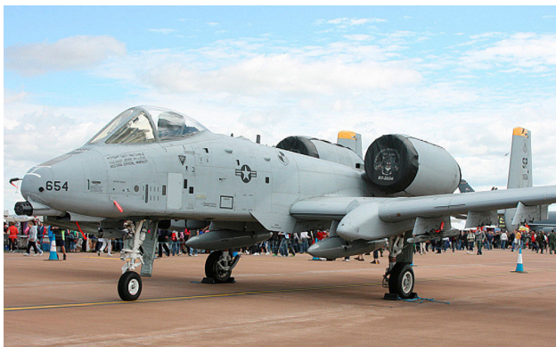
A-10 Engine Covers with Custom Artwork

ALL-YEAR USE MATERIAL - Made with Solution dyed Polyester fabric, the all-year use material is the best option for sun protection and cover longevity. This heavier more durable material is intended for all weather conditions, such as rain and snow or lots of sun.