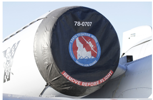
Fairchild A-10 Engine Covers