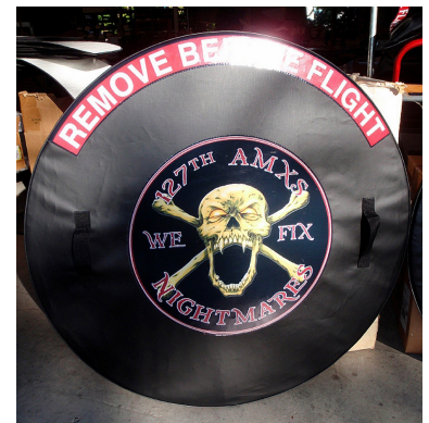
A-10 Engine Intake Plug