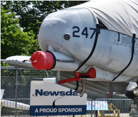
Fairchild A10 Thunderbolt Nose Gun Cover, Gun Scoop Inlet Plug