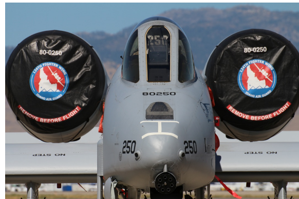
A-10 Engine Covers