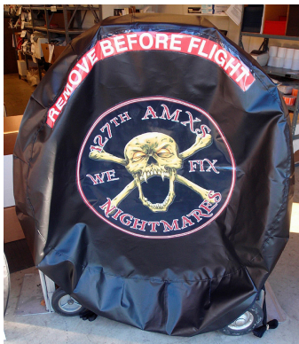
A-10 Engine Intake Cover

ALL-YEAR USE MATERIAL - Made with Solution dyed Polyester fabric, the all-year use material is the best option for sun protection and cover longevity. This heavier more durable material is intended for all weather conditions, such as rain and snow or lots of sun.