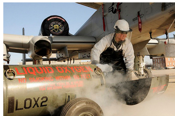
A-10 Engine Intake Cover