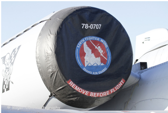
Fairchild A-10 Engine Covers

ALL-YEAR USE MATERIAL - Made with Solution dyed Polyester fabric, the all-year use material is the best option for sun protection and cover longevity. This heavier more durable material is intended for all weather conditions, such as rain and snow or lots of sun.