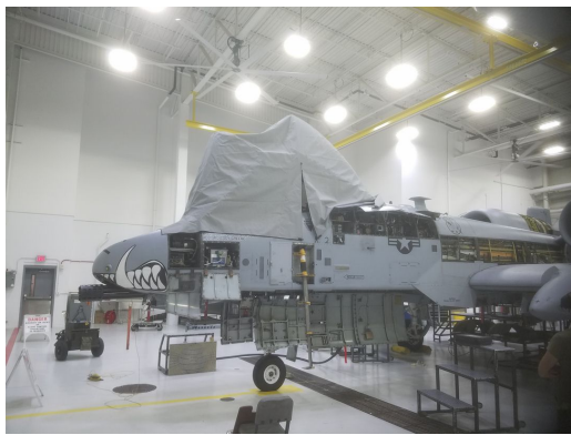
Fairchild A-10 Canopy Cover, open position