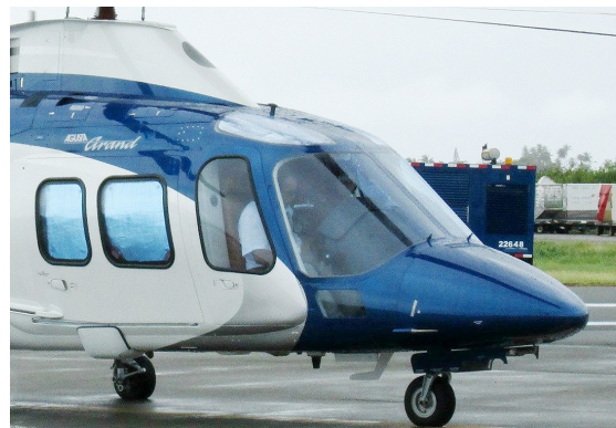
Agusta Grand Cabin & Skylight HeatShields