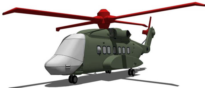
Sikorsky S-92 Windshield/Nose, Blade, Rotor Hub & Tail Rotor Covers

This cover type is made from Silver Acrylic Sunbrella canvas and is 100% lined with a soft and smooth microfiber. Bruce's Custom Covers developed this material combination especially for aircraft protection. The outer material is medium weight and treated for water resistance, UV resistance and anti-static buildup. The inner lining is a very soft and smooth microfiber to prevent scratching. The material is very reflective, and tests show that the cabin interior temperature can be reduced to near-ambient temperature on the hottest of days. It is water, ice and snow repellent, yet breathable to allow moisture to escape from between the cover and the aircraft surface.