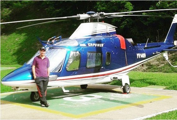
Agusta Power Cockpit & Cabin HeatShields

Heatshields are interior sunshades for an aircraft's windows or canopy glass. The product is a unique composite of closed-cell foam with a silver mylar finish. The semi-rigid design is stiff enough to stand along the inside of the windshield using sun visors or window framing. It folds up flat and easily stores in the included storage sleeve. Some designs may require velcro and suction cups. A Heatshield is an excellent short-term remedy for cockpit overheating.