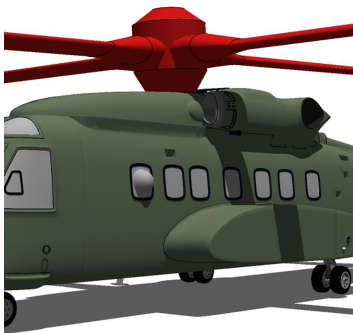
Sikorsky S-92 Main Rotor Hub Cover