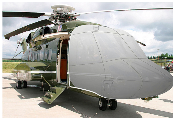
Sikorsky S-92 Windshield/Nose Cover (illustration)