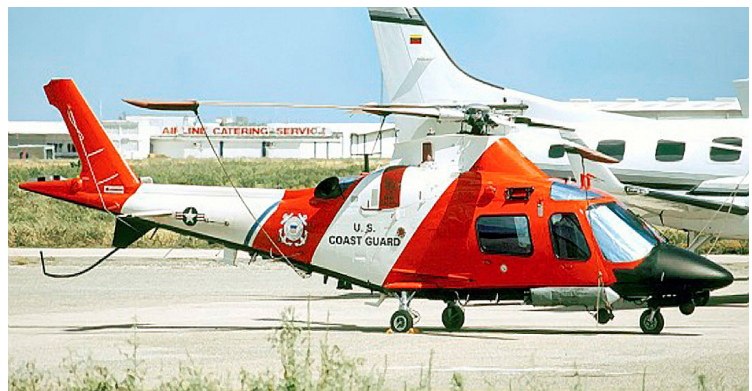
Covers, Plugs, HeatShields and related items for the Agusta MH-68A