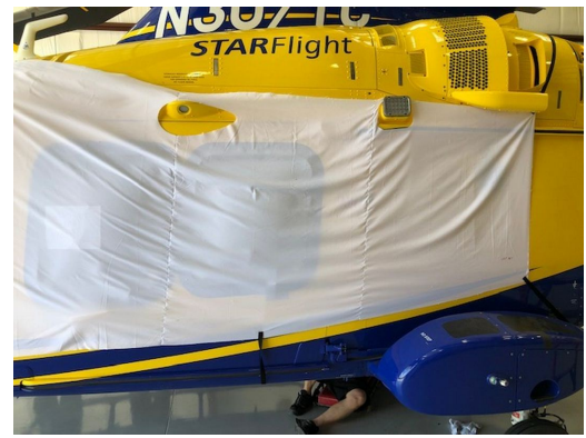
Leonardo (Agusta) A-169 Bubble Cover, test fit cover