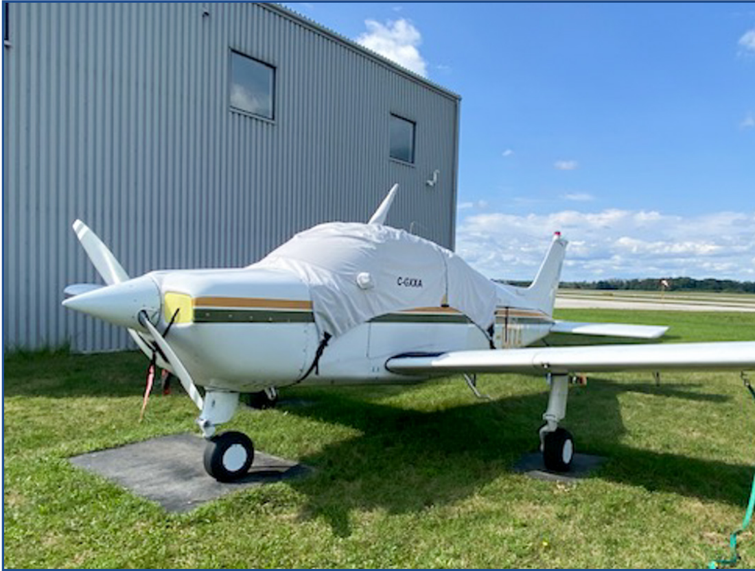
Beech Sport A19 Canopy Cover