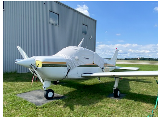
Beech Sport A19 Canopy Cover