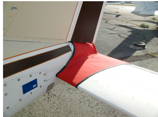
Beech Musketeer Tailcone Cover (Fully Enclosed)