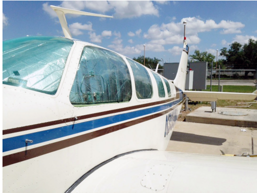
Beech Bonanza HeatShields

Windshield Heatshields are interior sunshades for an aircraft's front windshield. The product is a unique composite of closed-cell foam with a silver mylar finish. The semi-rigid design is stiff enough to stand along the inside of the windshield using sun visors or window framing. It folds up flat and easily stores in the included storage sleeve. Some designs may require velcro and suction cups or split right and left sides. A Heatshield is an excellent short-term remedy for cockpit overheating. An external fabric cover is far more effective and practical for long-term protection.