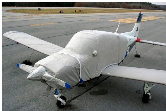
Beech Sierra Extended Canopy, Engine, Prop, Wings, Stab & Tailcone Covers