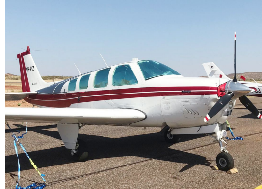
Beech A-36 Bonanza Cabin HeatShields