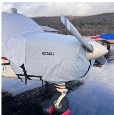
Beech Musketeer Insulated Engine Cover

This cover type is made from Silver Acrylic Sunbrella canvas and is 100% lined with a soft and smooth microfiber. Bruce's Custom Covers developed this material combination especially for aircraft protection. The outer material is medium weight and treated for water resistance, UV resistance and anti-static buildup. The inner lining is a very soft and smooth microfiber to prevent scratching. The material is very reflective, and tests show that the cabin interior temperature can be reduced to near-ambient temperature on the hottest of days. It is water, ice and snow repellent, yet breathable to allow moisture to escape from between the cover and the aircraft surface.