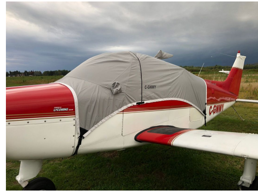
Beech Sundowner Travel Canopy Cover