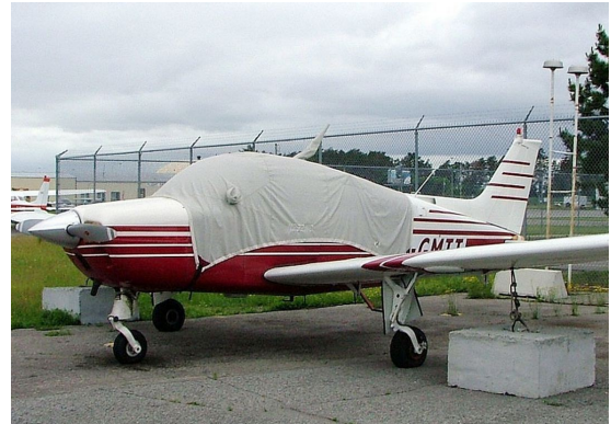
Beech Sierra Canopy Cover