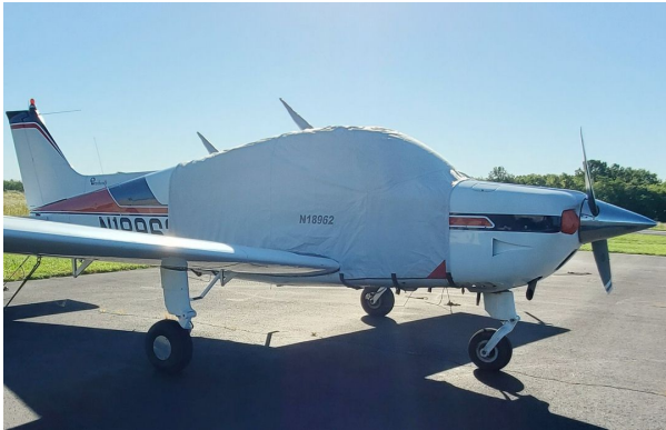
Beech C23 Sundowner Extended Canopy Cover

This cover type is made from Silver Acrylic Sunbrella canvas and is 100% lined with a soft and smooth microfiber. Bruce's Custom Covers developed this material combination especially for aircraft protection. The outer material is medium weight and treated for water resistance, UV resistance and anti-static buildup. The inner lining is a very soft and smooth microfiber to prevent scratching. The material is very reflective, and tests show that the cabin interior temperature can be reduced to near-ambient temperature on the hottest of days. It is water, ice and snow repellent, yet breathable to allow moisture to escape from between the cover and the aircraft surface.