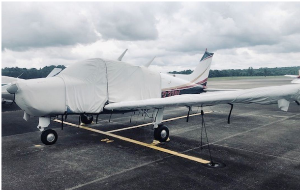
Beech Sundowner Extended Canopy Cover, Fully Enclosed Engine Cover, Wing Covers

WINTER USE MATERIAL - Made with Solution-Dyed Polyester fabric, this option is intended for seasonal use to aid in deicing, rain mitigation, or for occasional travel. The material is lighter and more compact, but more susceptible to UV damage and may have a shorter useful life if used continuously outside than the all-year use material.