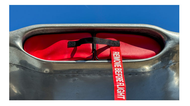
Douglas A26 Invader Oil Cooler Inlet Plugs