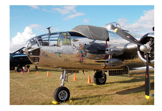
Mitchell B25 Cockpit Cover (Snap-On Type)

Engine Inlet Plugs are custom fit for your Douglas A26 Invader intakes, made with heavy-duty vinyl material, and stuffed with a single block of sculpted urethane foam. Each plug has a zipper that allows the foam to be removed and dried if necessary. Engine plugs have warning flags that are visible from the cockpit or 'remove before flight' streamers sewn onto the face of the plugs. Most plugs are imprinted with the aircraft registration number in black for an extra charge. Storage bag NOT included. Engine plugs may be inserted after flight when the engine is still warm. Engine Inlet Plugs are commonly referred to as Cowl Plugs, Intake Plugs, Cowl Blocks, Engine Blocks, and Engine Bungs.