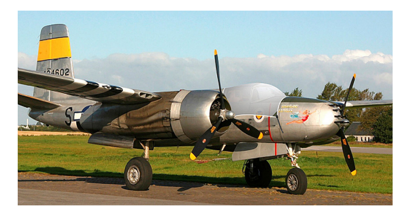
A-26 Invader Cockpit Cover (Illustration)