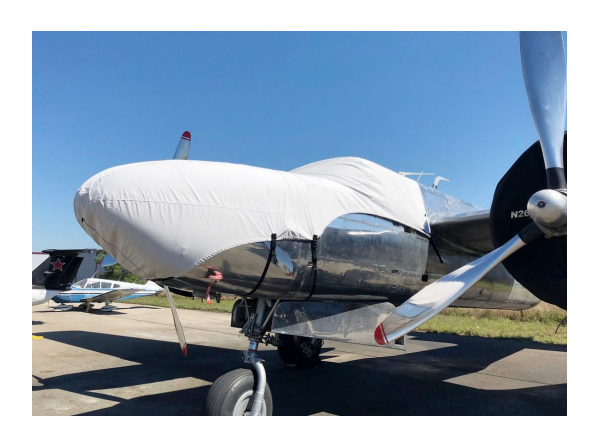
Douglas A26 Invader Cockpit/Nose Cover

the hottest of days. It is water, ice and snow repellent, yet breathable to allow moisture to escape from between the cover and the aircraft surface.