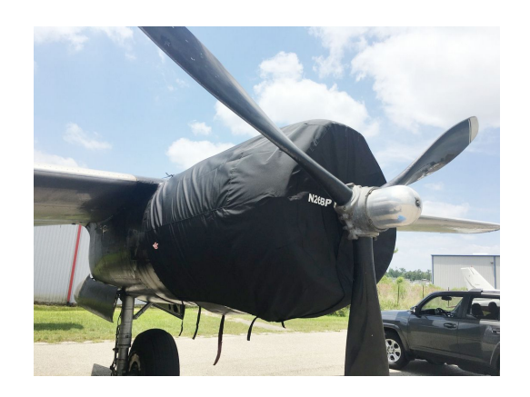
Douglas A-26 Engine Cover