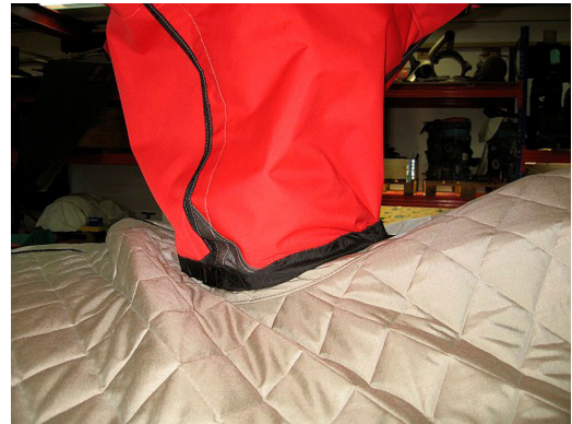
Alouette III Bubble, Rotor Hub & Engine Covers, Blade Tie-Downs