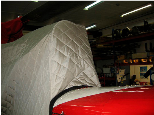
Alouette III Insulated Engine/Transmission Cover

WINTER USE MATERIAL - Made with Solution-Dyed Polyester fabric, this option is intended for seasonal use to aid in deicing, rain mitigation, or for occasional travel. The material is lighter and more compact, but more susceptible to UV damage and may have a shorter useful life if used continuously outside than the all-year use material.