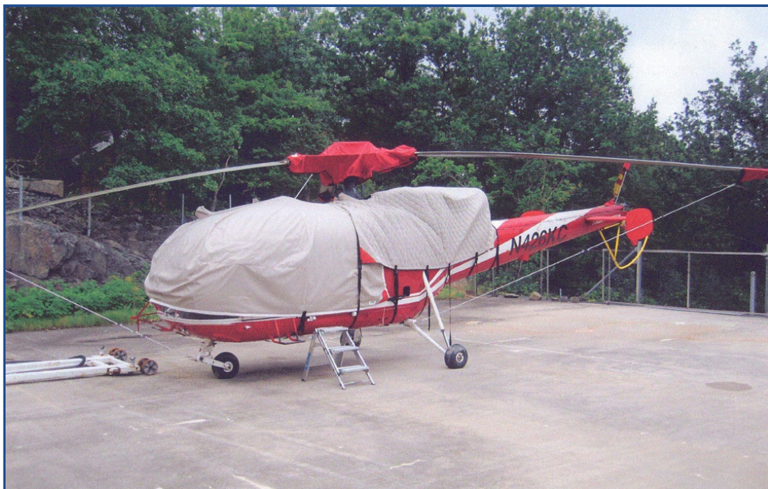
Alouette III Bubble, Rotor Hub &amp; Engine Covers, Blade Tie-Downs