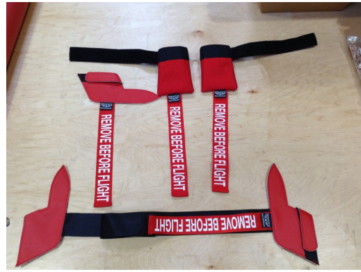
Airbus A319 Pitot & Tat Covers, Heat Resistant Type